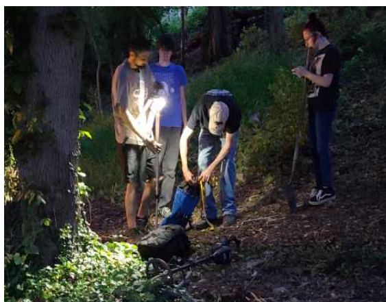
AS Dig (BB)