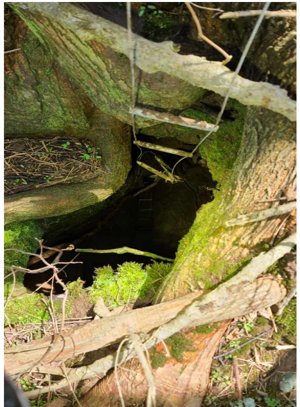
Turtle Cave (by Aquachigger)