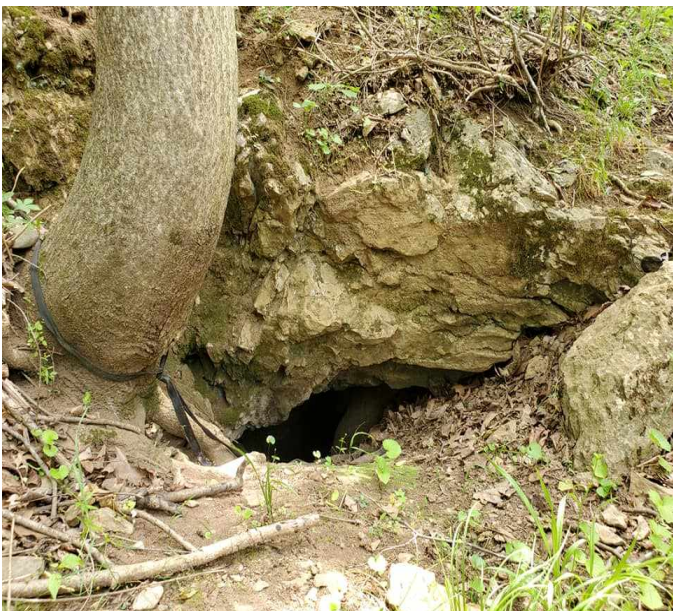
Dellingers Entrance (by Elysia Mathias)