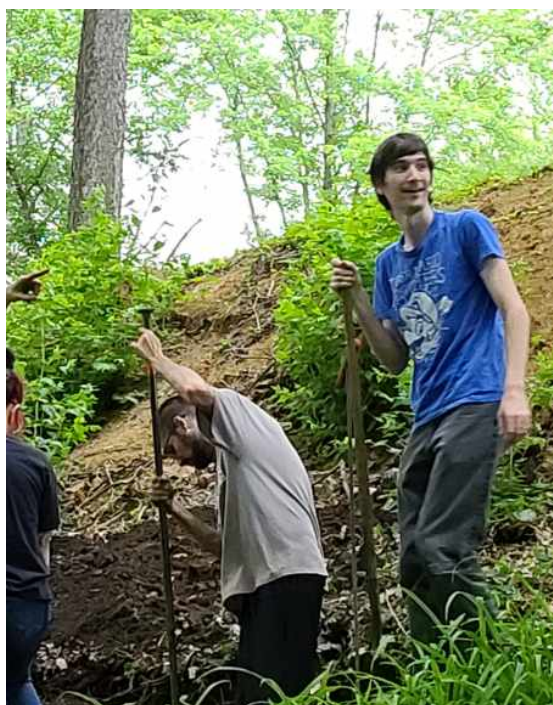
AS Dig (BB)