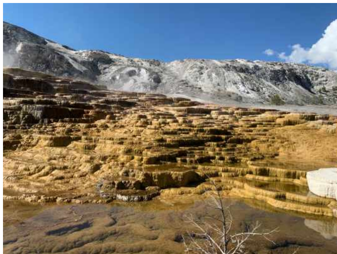
Mammoth Hot Springs

Yellowstone National Park, Mammoth Hot Springs – Caving outdoors! The geothermal waters issue limestone.