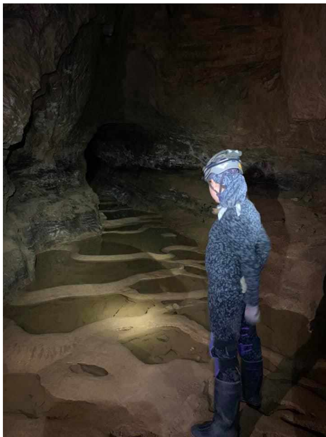
Rimstones in Butler Cave