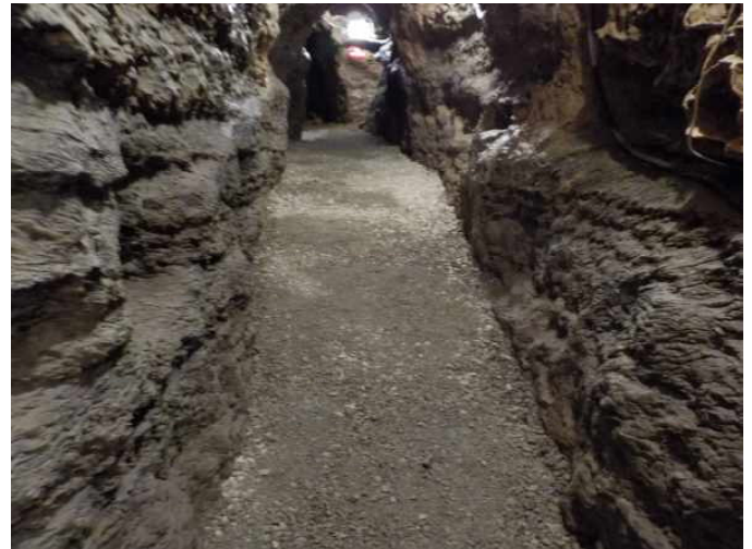
There were places we put down up to 4” of new gravel

She kept saying, “Oh, it looks so nice! Thank you, guys, thank you, guys. I really appreciate it.”