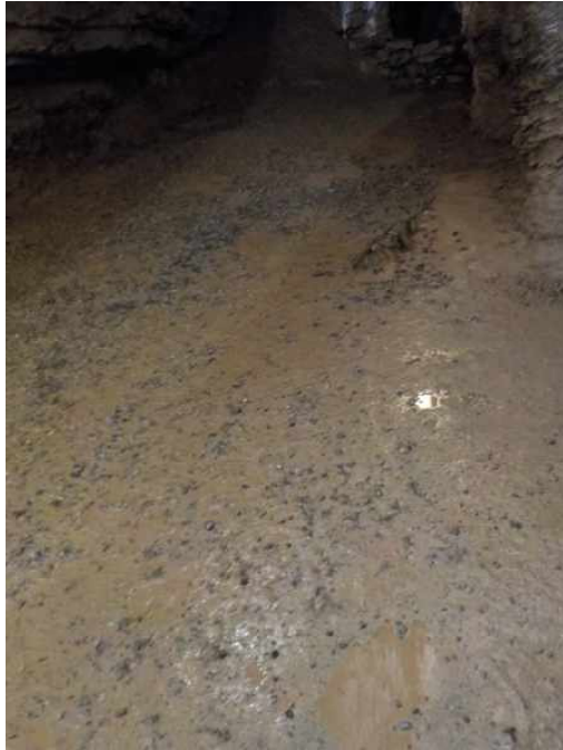
Path before new gravel

We went a little-ways up it and took a lot of pictures of the pretty formations. We exited the cave happy that our project was done. We were finished before Crystal Grottoes closed for the day. We won the Gravel Challenge!