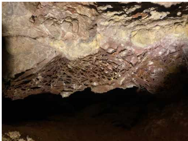
Boxwork in Wind Cave

On a family vacation, we stopped at Wind Cave National Park. One needs to purchase tickets for the morning of the trip. There was a long line stretching out of the building onto the sidewalk, then turning on the sidewalk to a shade tree and beyond. I thought we would never see the inside of the cave. But we finally made it!