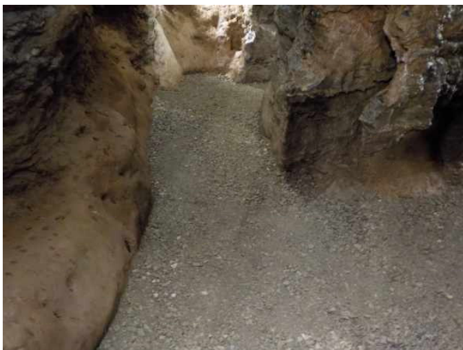
Path after gravel

I went inside the cave house and told Cassie that we were done. She wanted to see it, so I