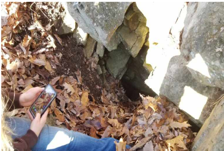
New 100' Cave in Hampshire Co (by Beau Ouimette)