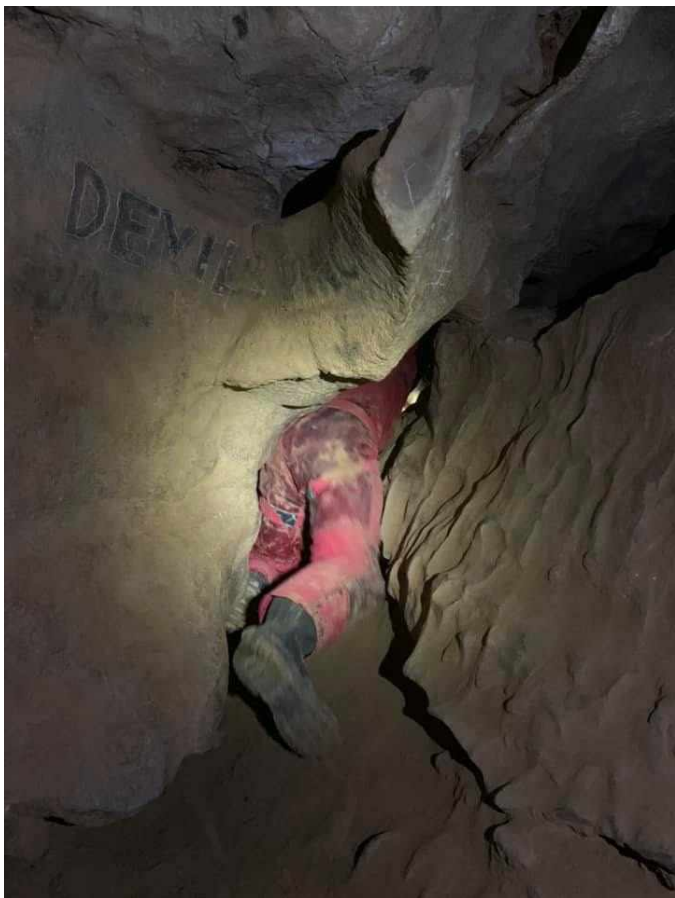
(by Ashley Hitchcock)