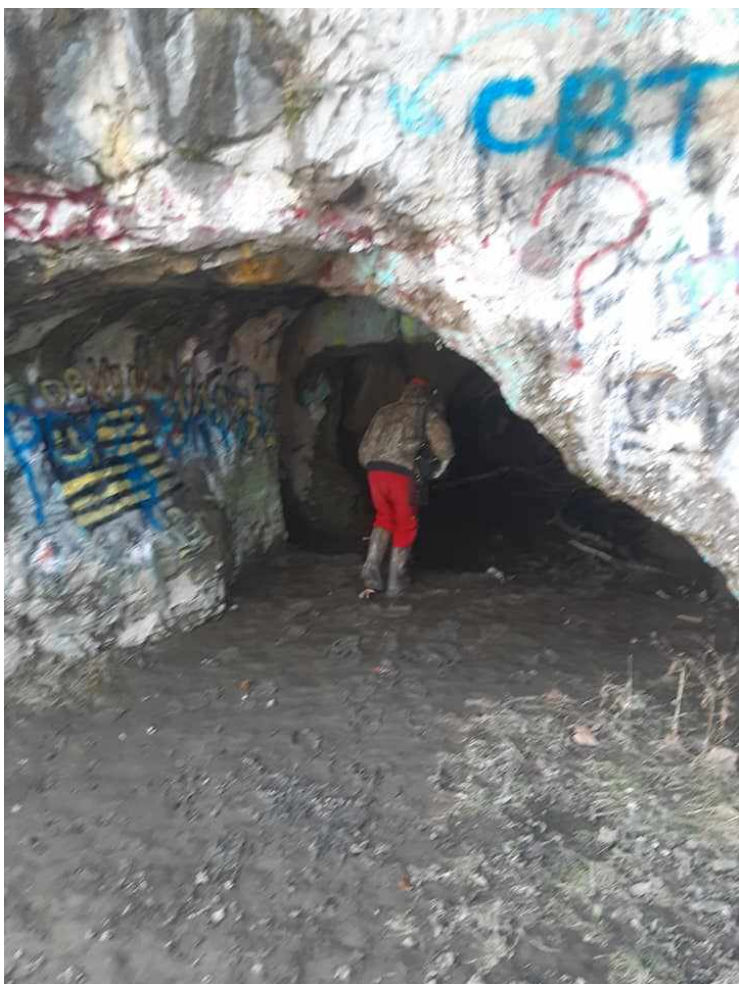
Conodoguinet Cave