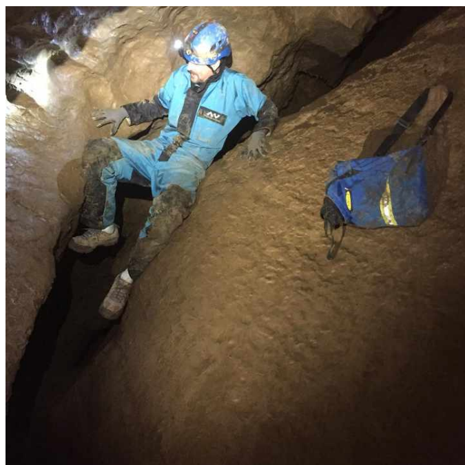
Dead Dog Cave (Kevin Hughes)