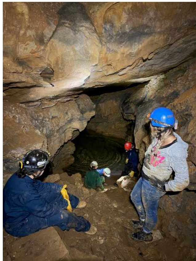
Water in Donaldson (by TomG)