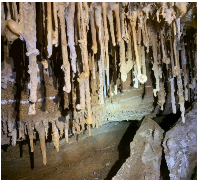
Norman Cave