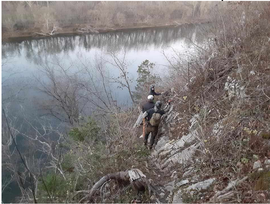
The open trail to Indian River Cave (by Adam Haines)