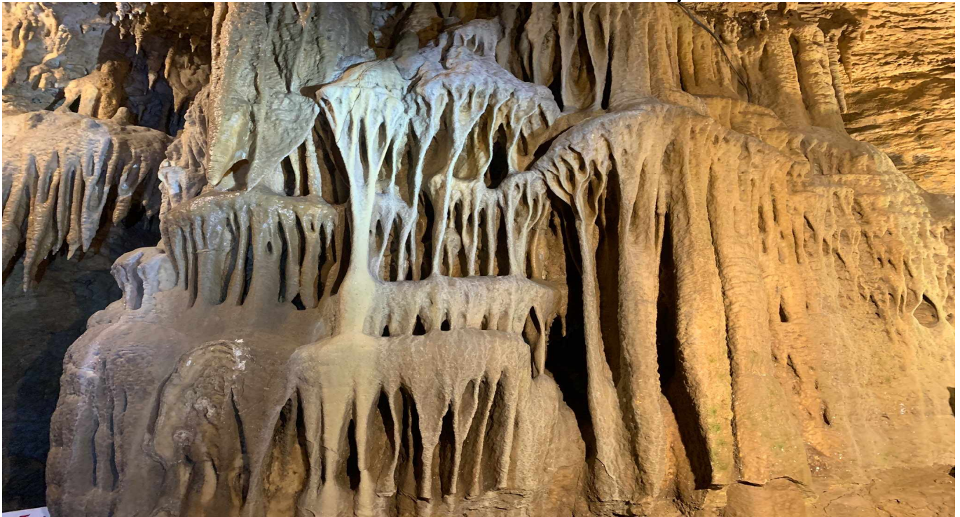
Crystal Grottoes (by Jerry Bowen)