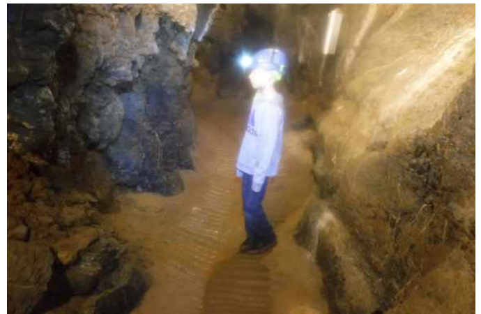
The cleaned TSG Passage