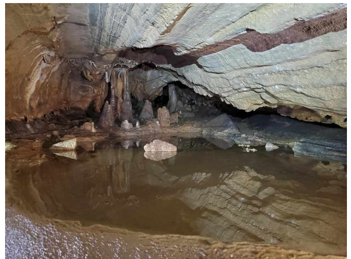
Black Coffee Caverns (by Elysia Mathias)