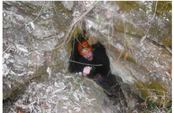
Crystal Grottoes Quarry