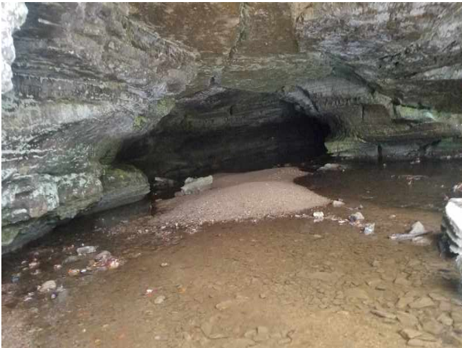
Sinks of Gandy (BB)