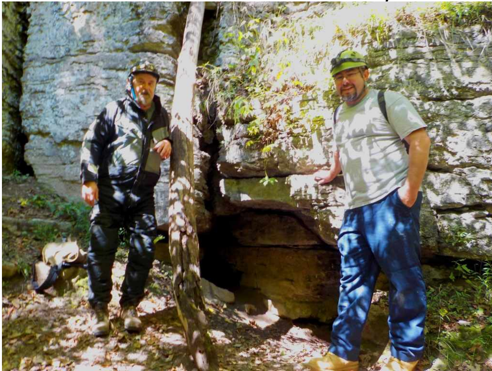
Key Cave