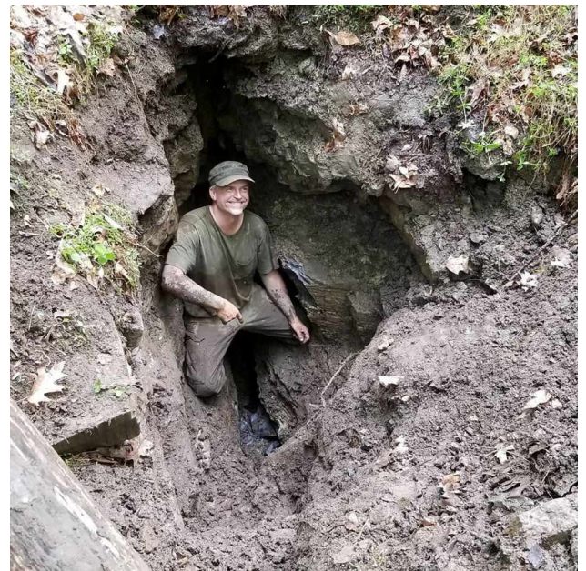
McMiner Cave (Beau-Aquachigger)