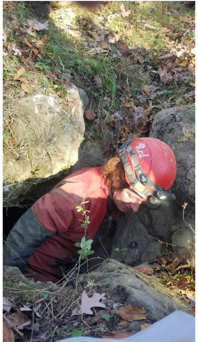
Red Almost out (BB)