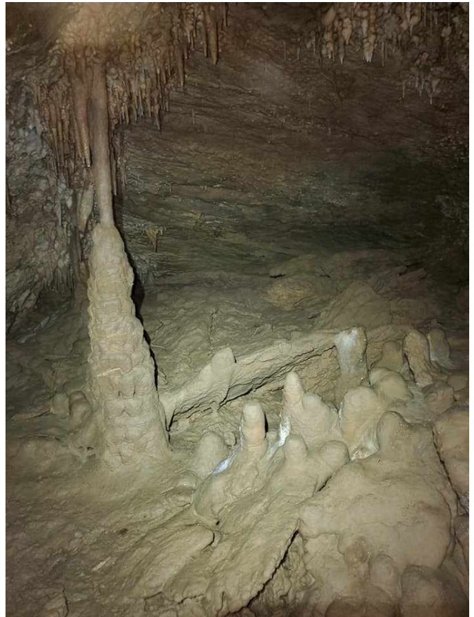
Dead Dog Cave (Elysia)