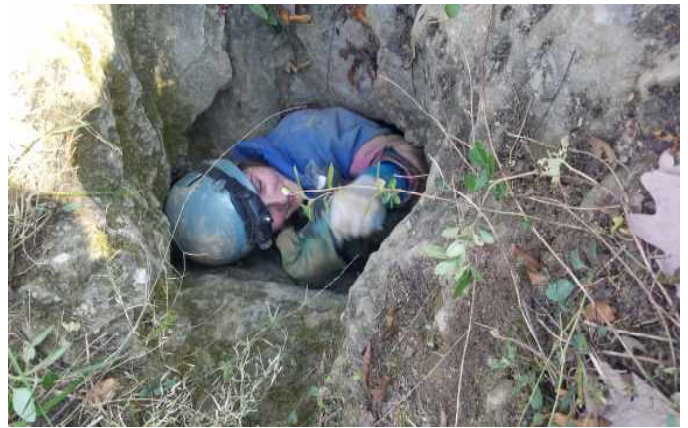
Elysia's Turn (BB)