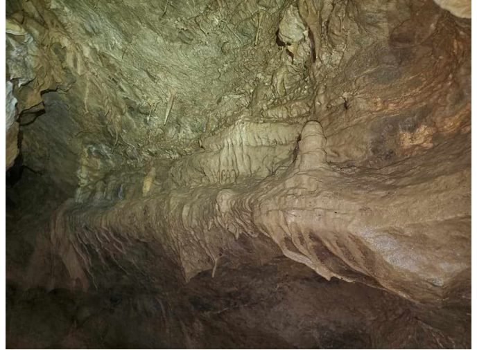
Dead Dog Cave (Elysia Mathias)