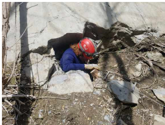
Red coming out of Dry Quarry Pit (BB)