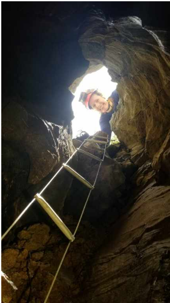
Dry Quarry Pit