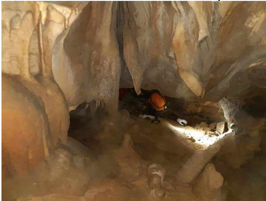
Donaldson Cave