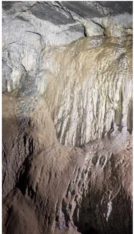
Conodoguinet Cave