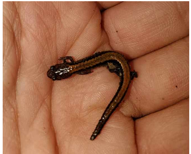
By Elysia Mathias

Gary, Elysia, Red and Tom walked down the tow path of the C&O Canal towards Dam 4. The purpose was to check an area high on a ridge. On the way down we found 2 small holes in the side of the cliffs near the bottom. GPS and pictures were taken. One I was able to get inside for about 15 feet before pinching out at the bottom. The second was a very low crawl for about 10 feet then you could stand in a bent over position, which ended at about 15 to 20 feet. Elysia and Red made it into this cave. Since Red had never been into Dam 4 Cave, we spent the rest of our time hitting a few passages in Dam 4. We found 2 ropes inside and lots of salamanders on the way.