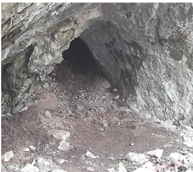
Cricket Cave (Adam Haines)