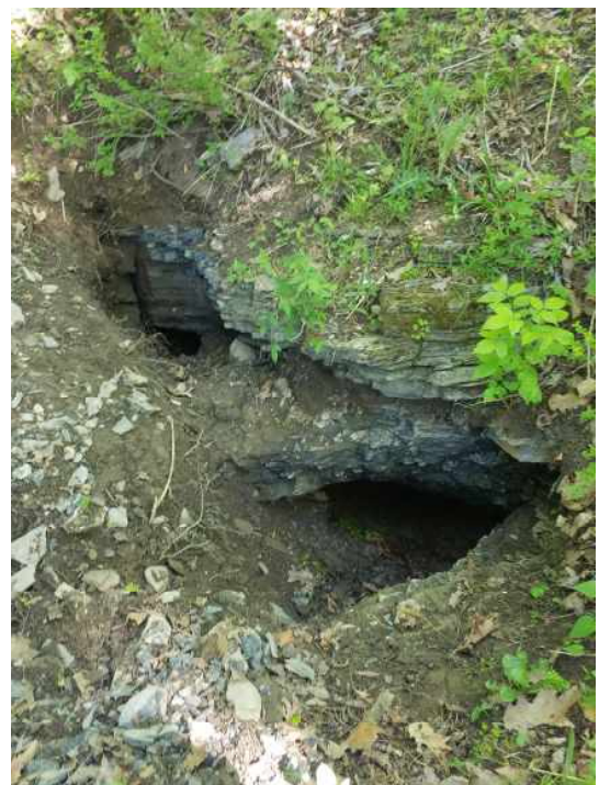
Hampshire Co Resurgence (BobB)