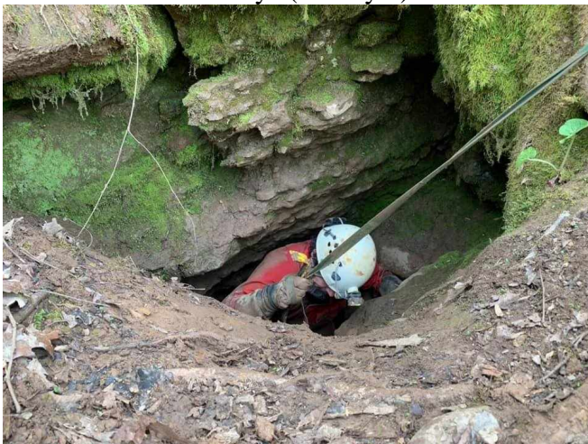
Hancock Cave