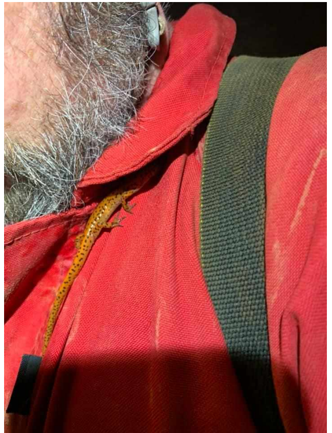
Pet salamander in Hancock