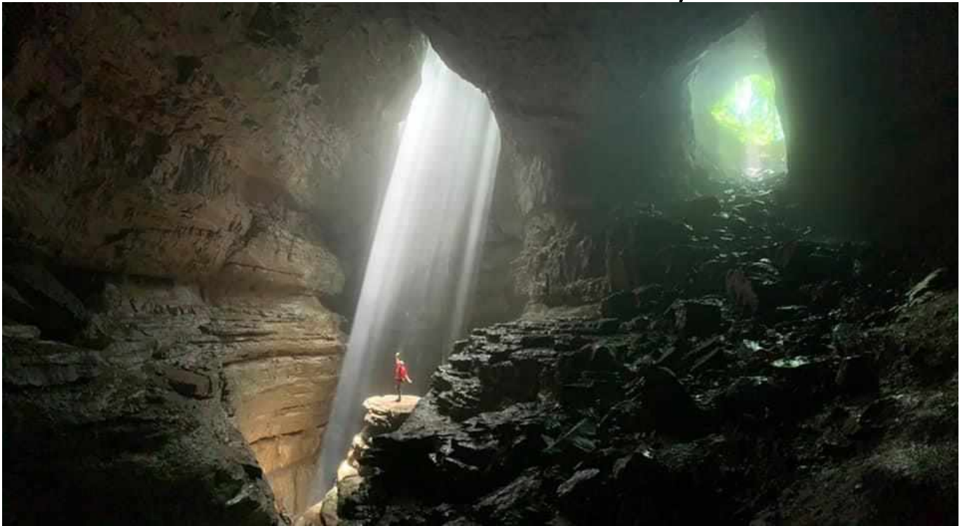
Stephens Gap cave