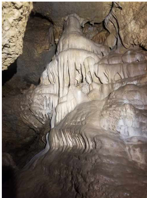
Izaak Walton Cave