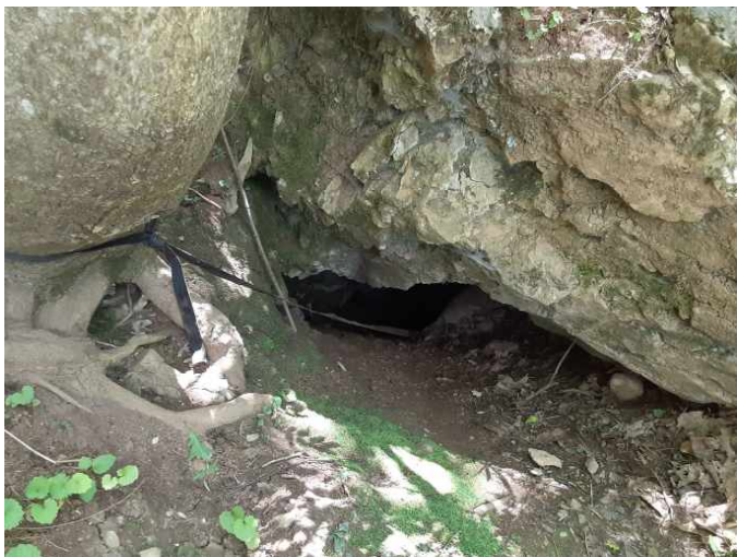
Dellingers Cave