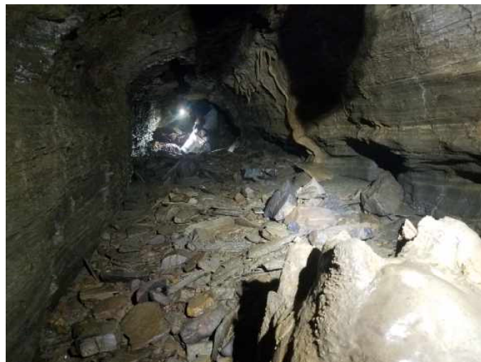
McMiner Cave (BB)