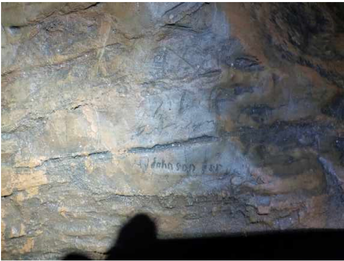
Newly found signatures in Donaldson (BB)