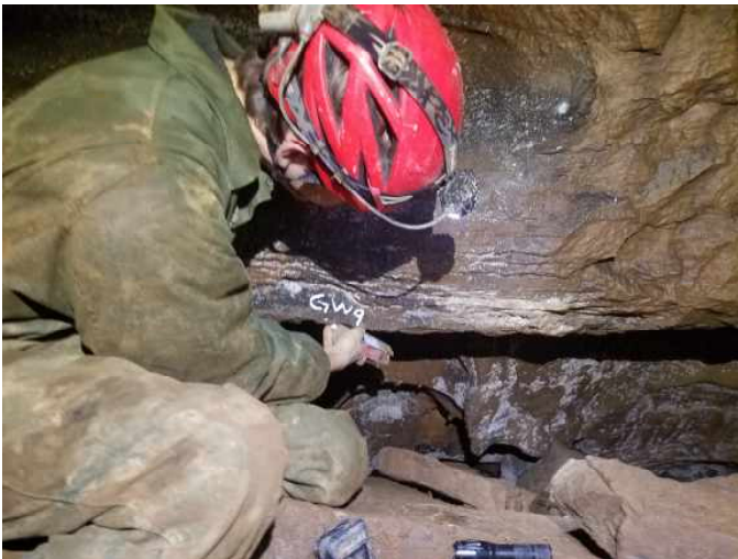
Shooting the back shot at the same station (BB)