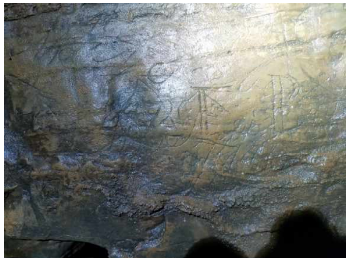
More signatures in Donaldson (BB)