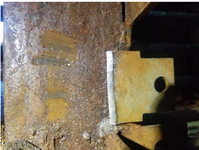
Shows the clean cut on the Donaldson gate (BB)