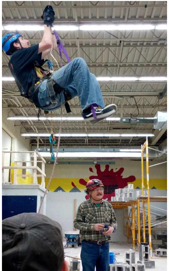
Vertical practice (by Doc)