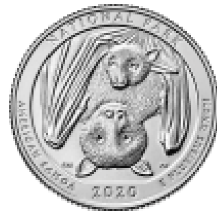
The new American Samoa National Park Quarter