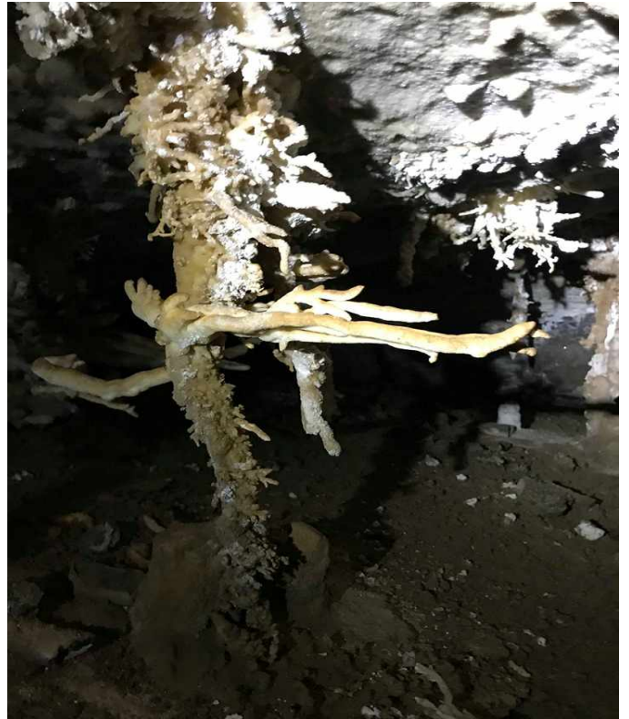
Better Crocker area (by Billy G)