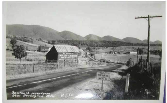
An old photo that Jerry Bowen ran across showing an Endless Cavern advertisement. The barn is still there but the advertisement is gone.