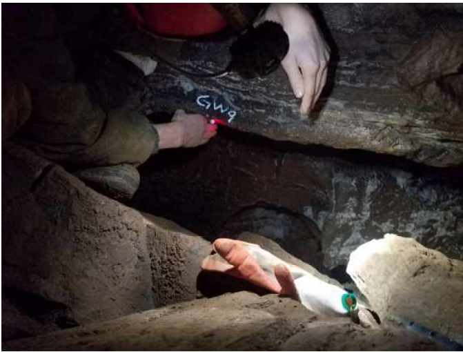
Survey shot in Donaldson with the laser point (BB)