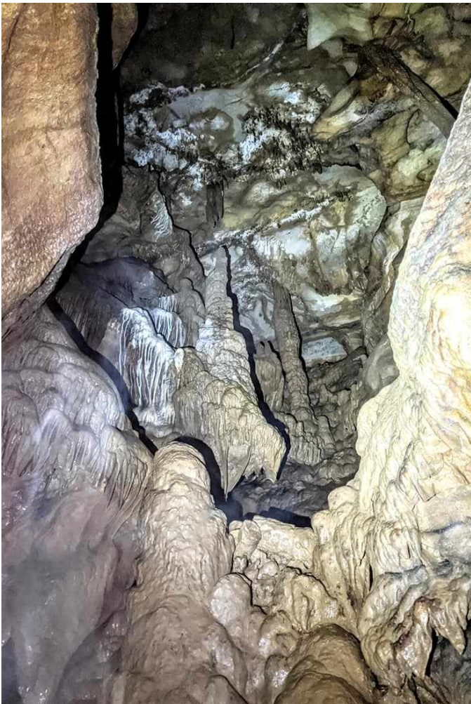
Formation Room in Whitings Neck (Ashby Haines)