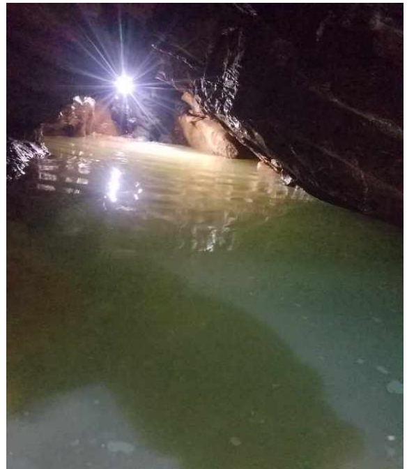
Water in Donaldson (BB)