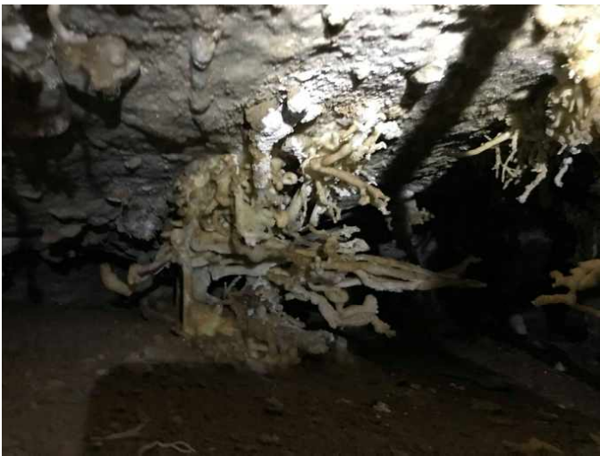
Hercules in Scott Hollow