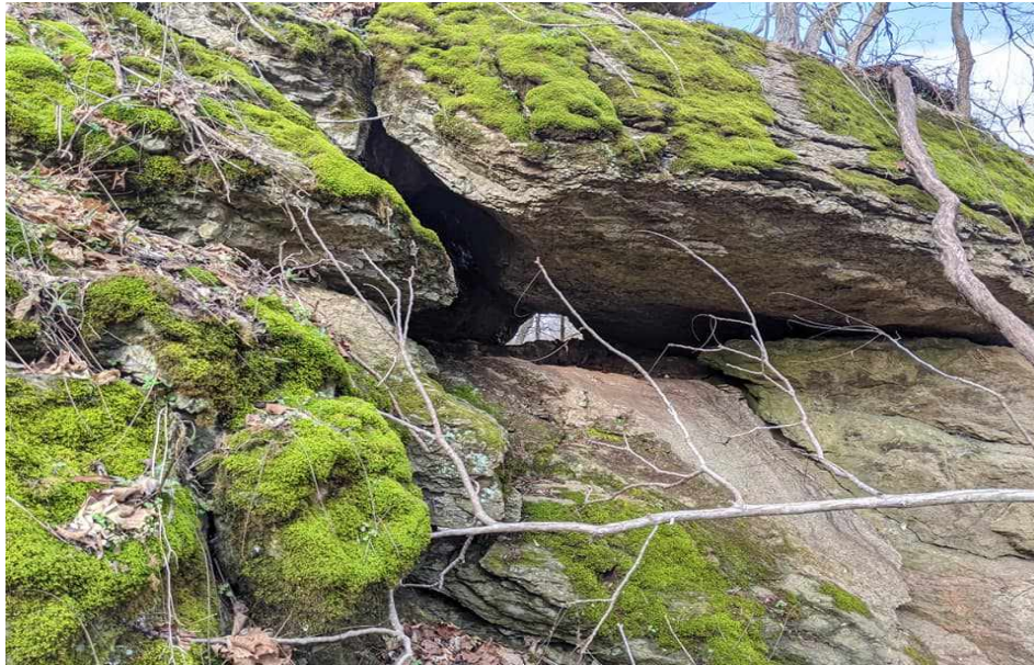
One of the small caves in Jefferson Co