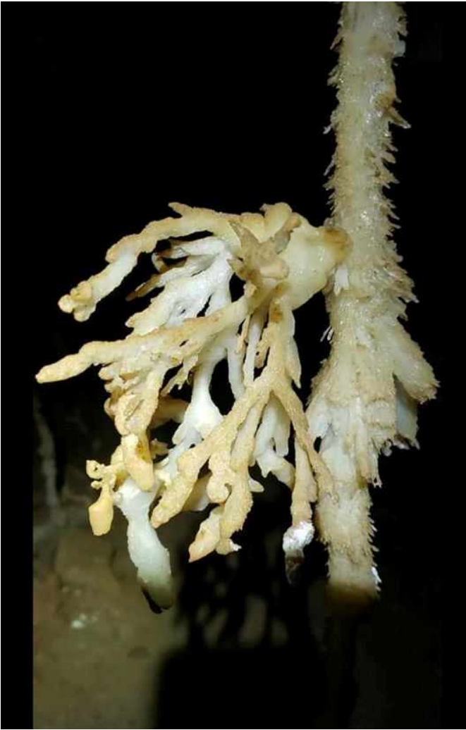
Betty Crocker area in Scott Hollow