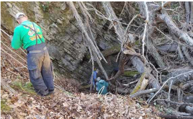
Tom pulling up the bucket