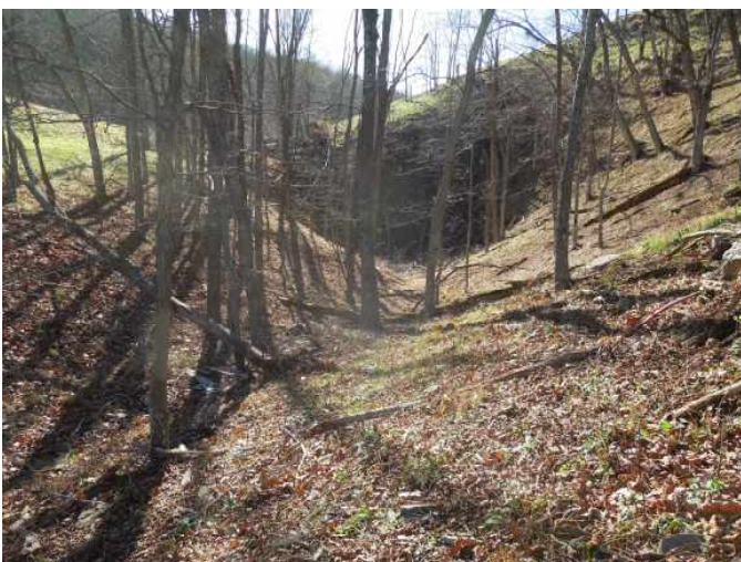
Looking down into the Sinkhole