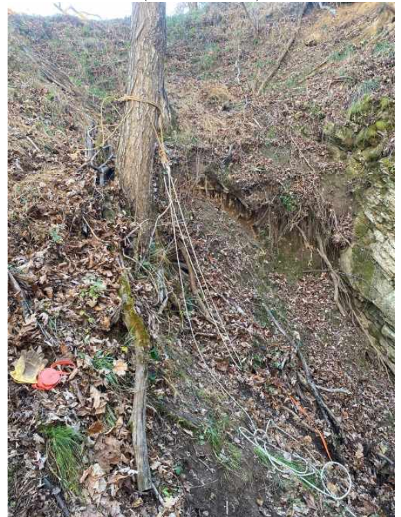
Tom rigged the ropes with pulleys to haul the buckets (TomG)