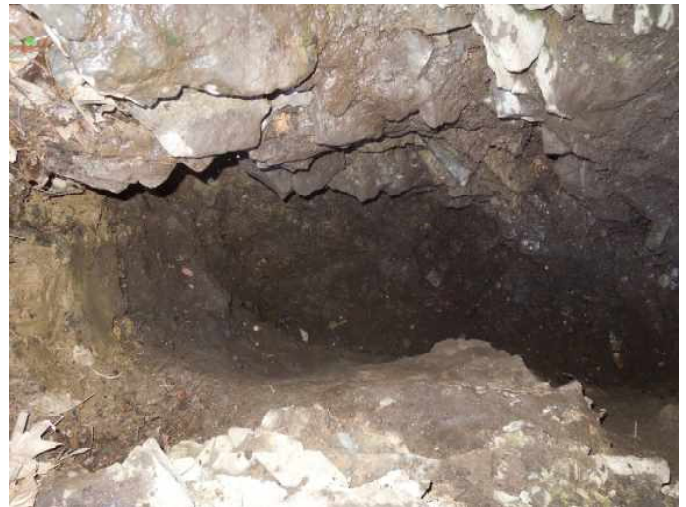
The dig hole (by Jerry B)