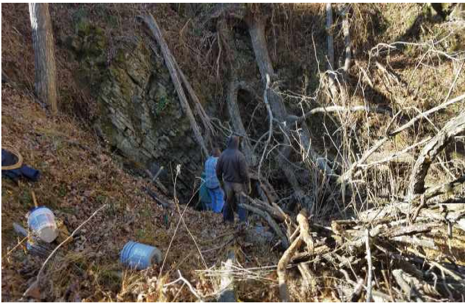
Mass of downed trees in the sinkhole