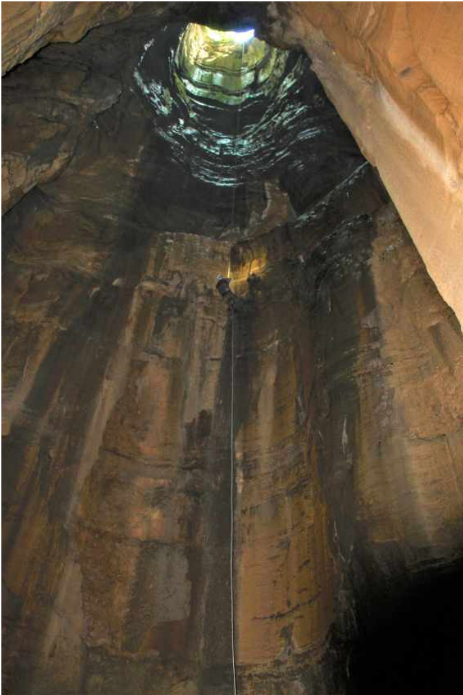
Clint Ascending Cagles Chasm

drops for the trip, Shawn was the person to rig the ropes, first to rappel into the cave and the last to ascend out. This cave is also located in a wooded area, well up a mountain where we enjoyed the cries of nearby coyotes. Once completed, Shawn rigged another entrance drop to the cave a bit further up the mountain and proceed to drop about 50 feet into another part of the same cave.