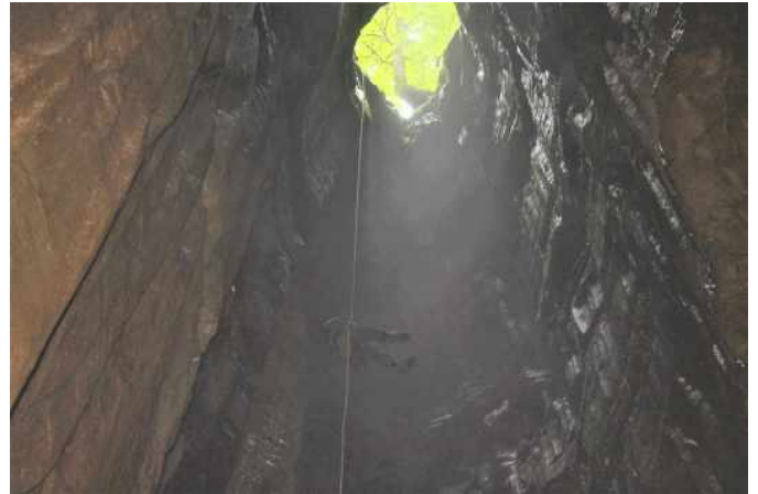
Clint Rappelling into South Pittsburg Pit

2,200 feet of surveyed passage that has been a popular destination for visitors since its exploration by Chattanooga Grotto in 1964. At the bottom, we found a dead, partially decomposed rattlesnake. We also found a nice flowstone formation with a sizable pool of water. There was no caving on the agenda for us beyond the bottom of the entrance pit as we wanted to reserve time for Cagle's Chasm.