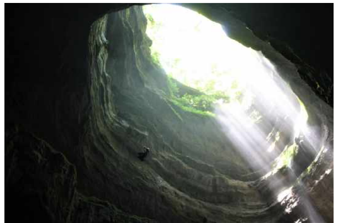
Clint Ascending Neversink

there is no caving at Neversink, as it's just a pit. But, the pit is complete with a waterfall that flows from the top all the way to the bottom. The pit is unique in that you rig the rope well below the cusp of the top of the pit. There is a pathway that drops you about 20 feet below the top of the pit where you rig into two bolted anchors. On the opposite side of the pit is the waterfall, so while we were dry during the rope work, we were able to enjoy various views of rainbows while rappelling and ascending. Once again, at the bottom, we found a dead, partially decomposed rattlesnake, lots of frogs, and more nice views of the waterfall.