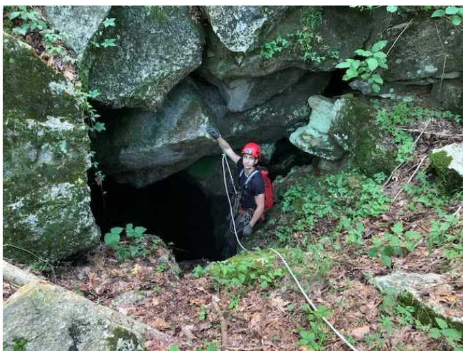
Shawn in Greens Well

volume of water was increasing. The weather forecast did not show a high chance of rain, but there is always some doubt as it was after all summertime in the South. Convinced the water volume was increasing, Clint started up the rope and would complete the ascent in 14 minutes and 56 seconds. That was a respectable time for the 227-foot ascent in water for a 56-year-old. As he was traveling up through the water, it was clear to him there was no increase in water volume. Once outside, Clint informed Shawn there was no rain. It was simply another hot sunny day just like it was when we entered. Using the Frog system, Shawn had completed the ascent in a short 8 minutes and 46 seconds, while declaring the pit his favorite of the trip.