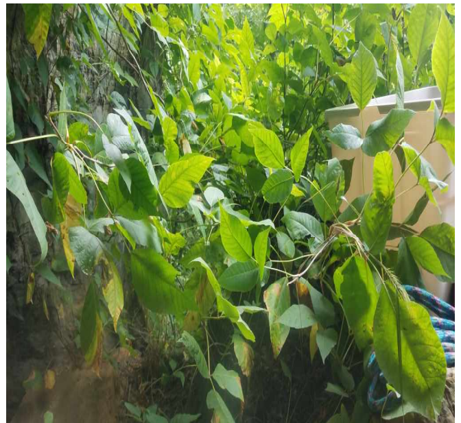
Lots of Poison Ivy at Baker! (BB)