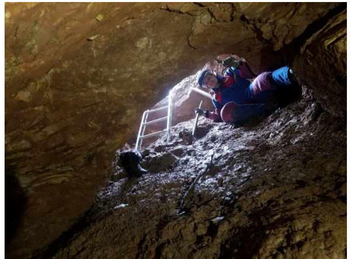
Elysia in Milton Cave (BB)

10-6-19 – I was contacted to take a crew caving, so I took them to Donaldson's Cave, Berkeley Co, WV. 3 adult and 2 kids besides myself. We started to do the circle trip. It seemed that no one was following so I backed out, then went around. Once back near the entrance 2 of them headed down the rabbit hole which was completely dry. They even went in the narrow tube in that area with the signature in the ceiling. No water in the cave until you went through to the break down pile. Then there was very little water at the bottom. More muddy cavers, another good trip. The lock combo was changed after that trip.