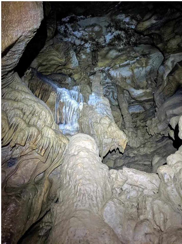
Whittings Neck (Ashby Haines)