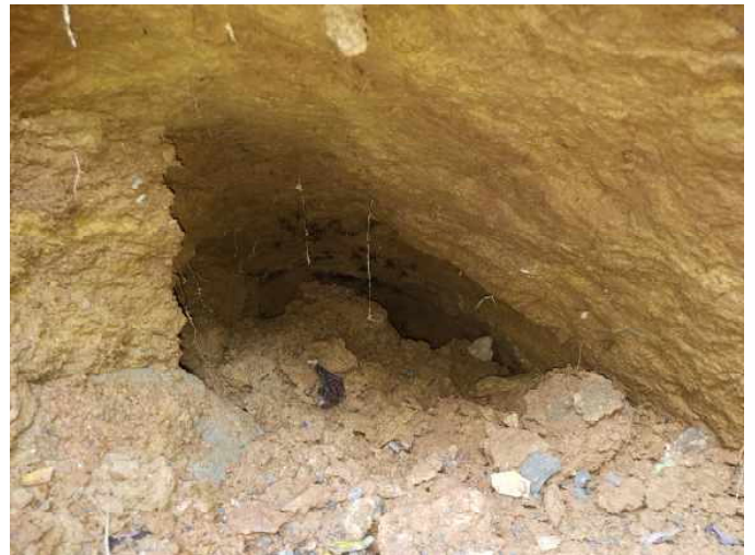
Sinkhole along Rt 340 in Jefferson Co with lots of cave crickets! (BB)