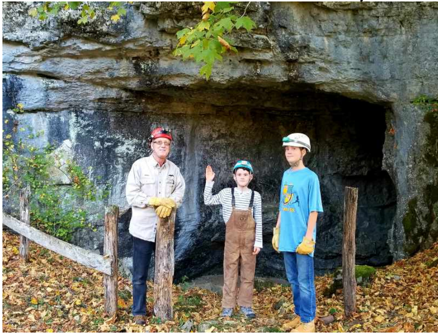
This picture sums up our whole weekend. The Saltpeter Entrance (Snedegars) to Friars Hole. (Jerry Bowen)