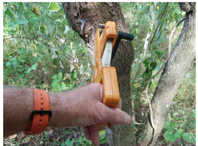
Whittings Neck above ground survey (BB)