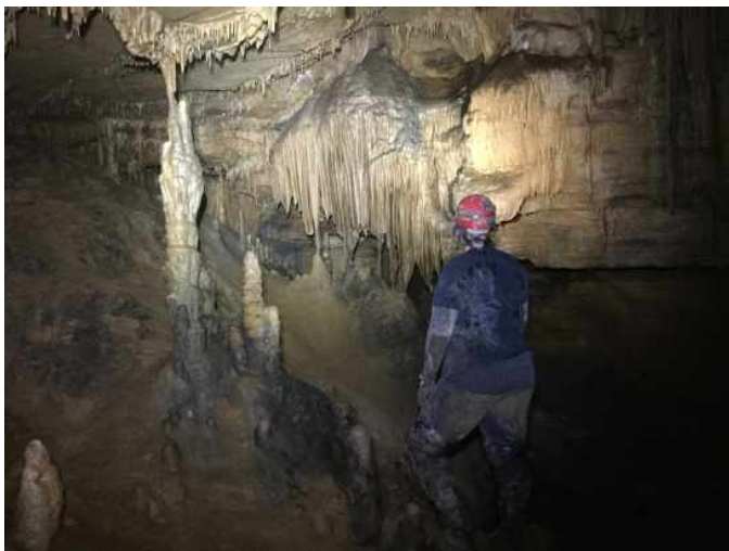
George Eye Cave