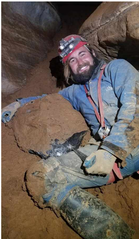
Rock with bull pin

With the rock gone Irina kept digging & was able to squeeze into the room. It was only about 15ft in diameter & tall enough to stand, with a crystal pool & some mud hoodoos. Sadly, it didn't go. I wasn't able to fit through so Nick came up & began surveying out with Irina. Once we had shots out of the room, I took up front Disto to complete the tie into a known station in the Pulpit Room.