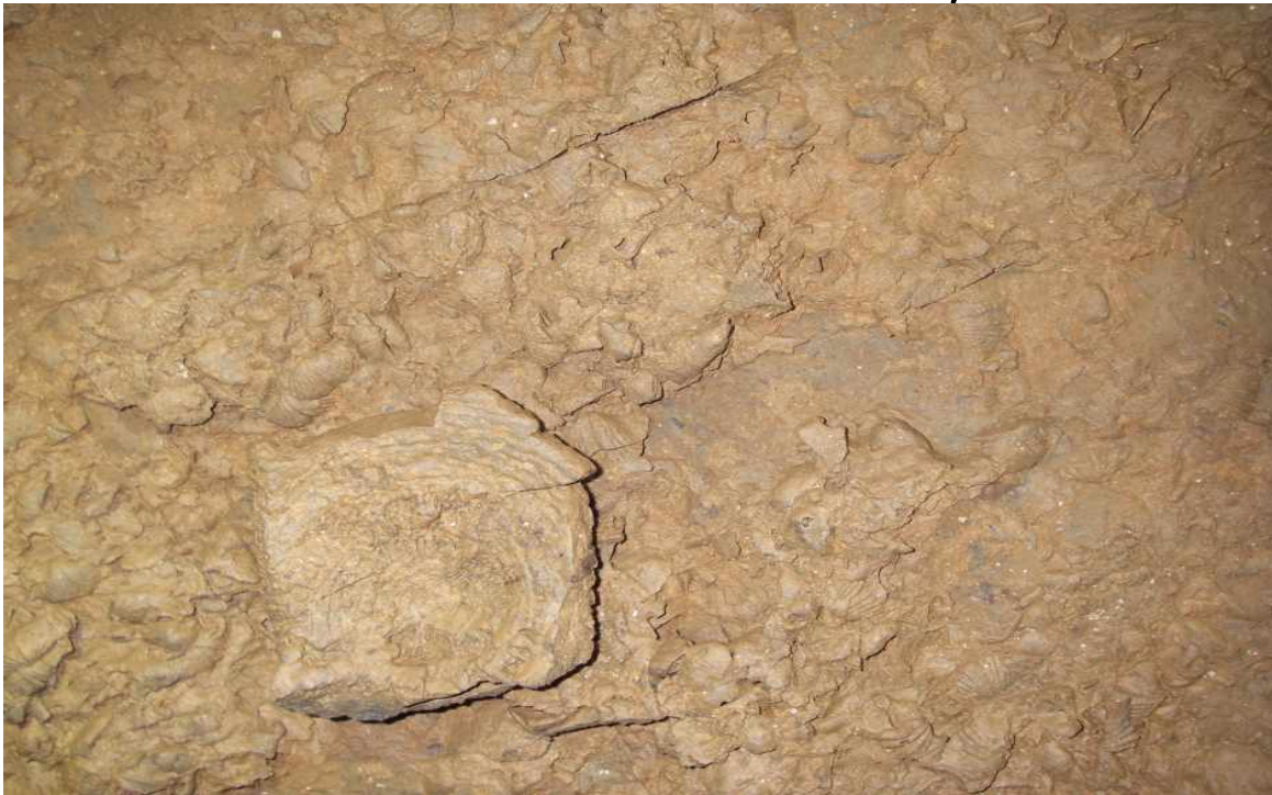
Coral formation in Blowing Cave in VA