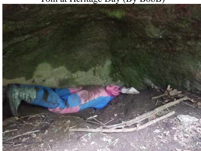
Where the Hell Is It