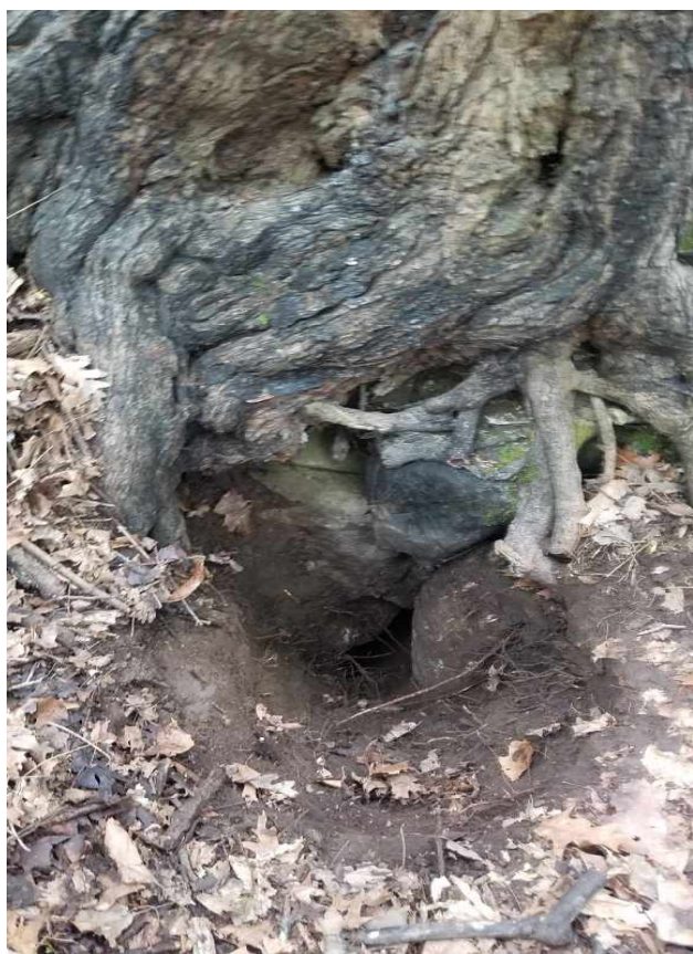
New dig (BB)