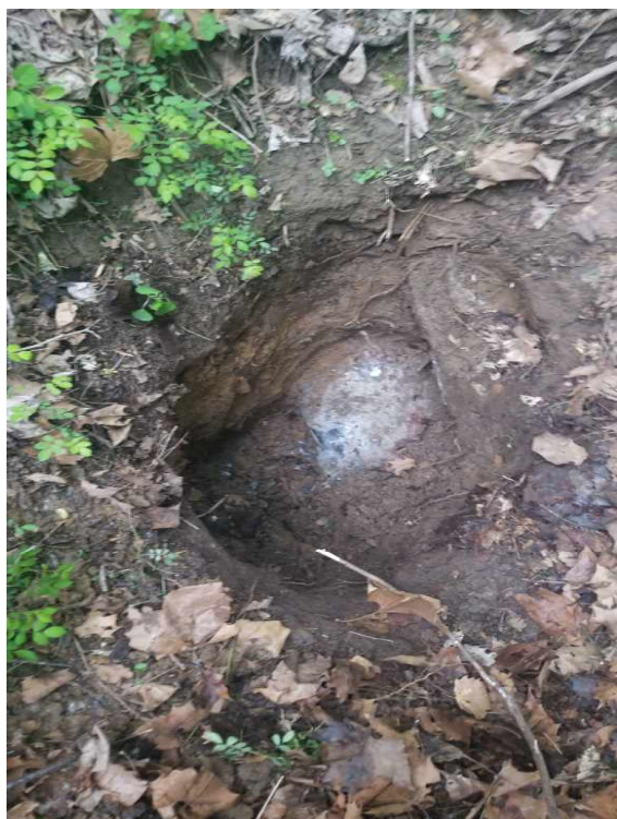
No Clue (Tom Griffin)