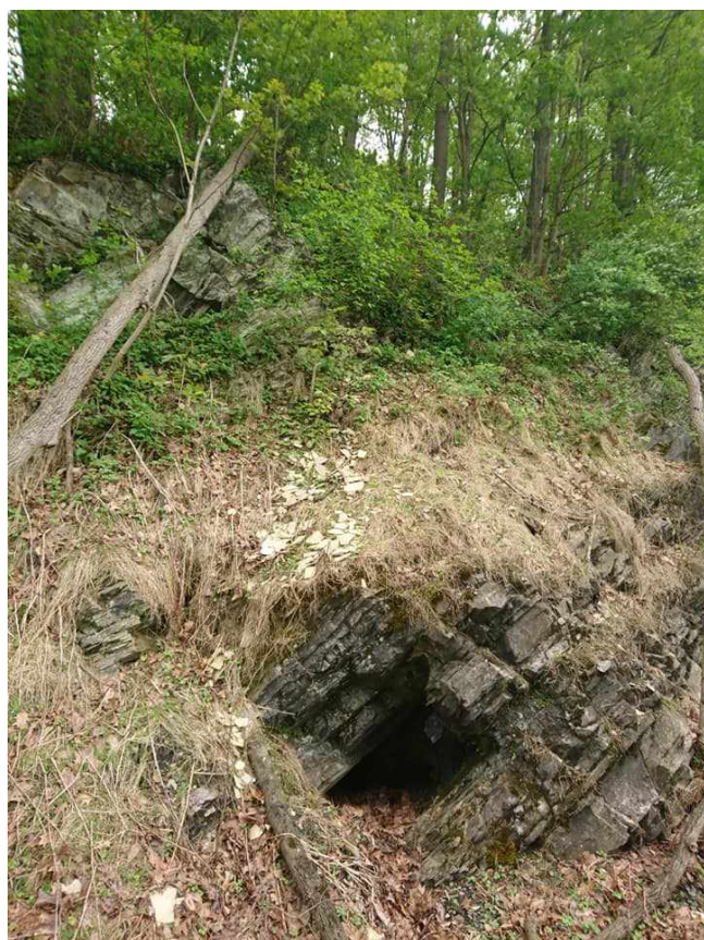
Grasshopper (Daniel Allen)