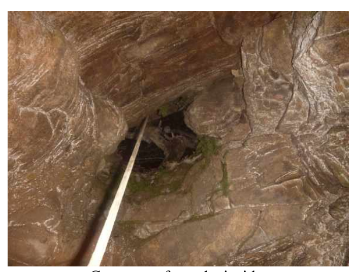
Carpenters from the inside.