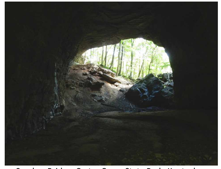
Smokey Bridge, Carter Caves State Park, Kentucky.