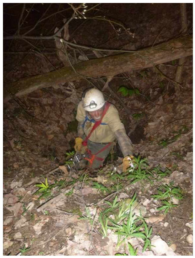
Terry preparing to rappel.