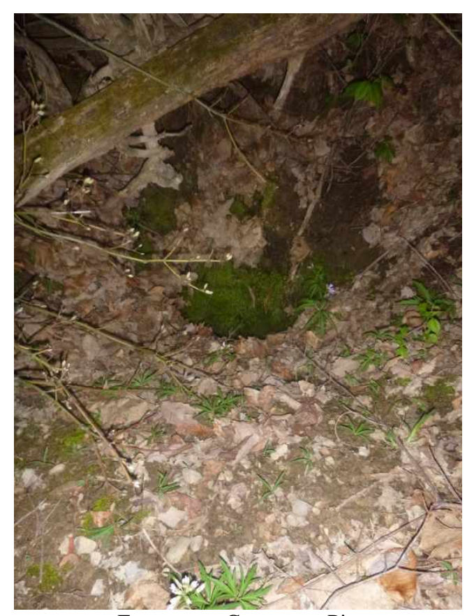
Entrance to Carpenters Pit.

but whose records were impeccable. That Marvin was able to estimate the location from a topo map (decades before GPS) to within a hundred feet accuracy is really pretty amazing.