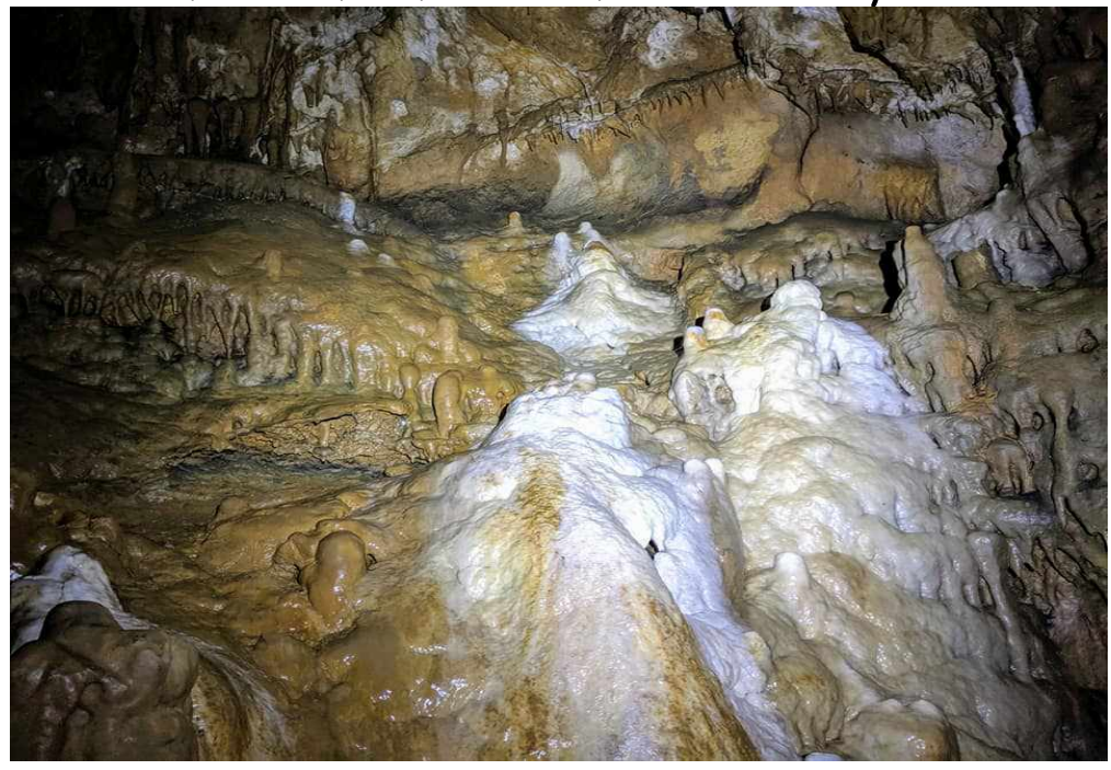
Whitings Neck