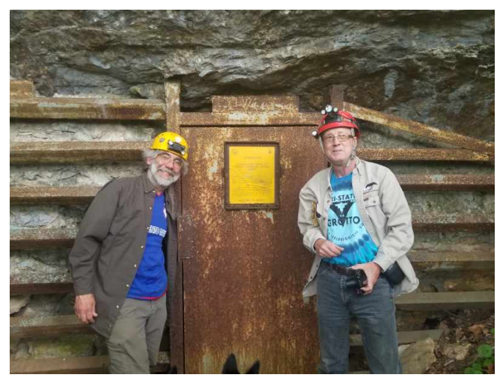
Madison Saltpeter Cave