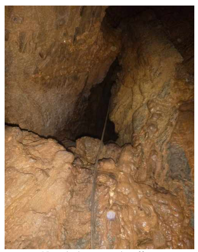
Near the bottom at the offset.