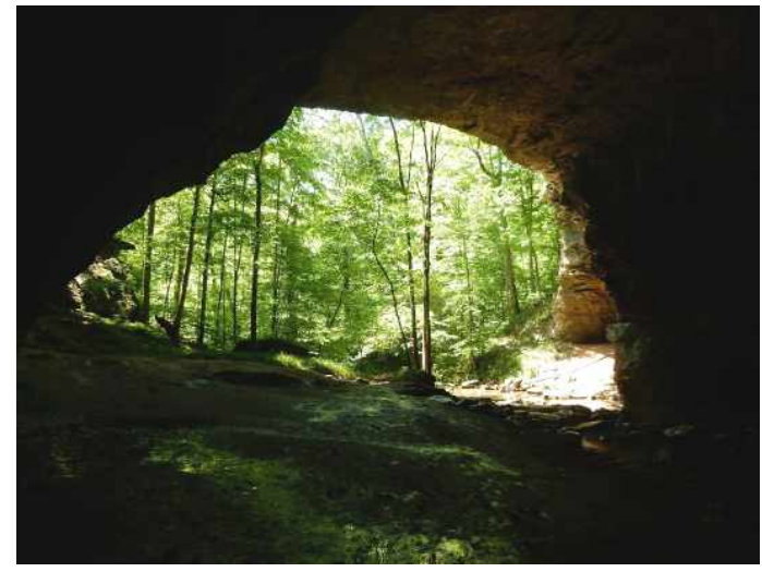
Natural Bridge, Carter Caves State Park, Kentucky.