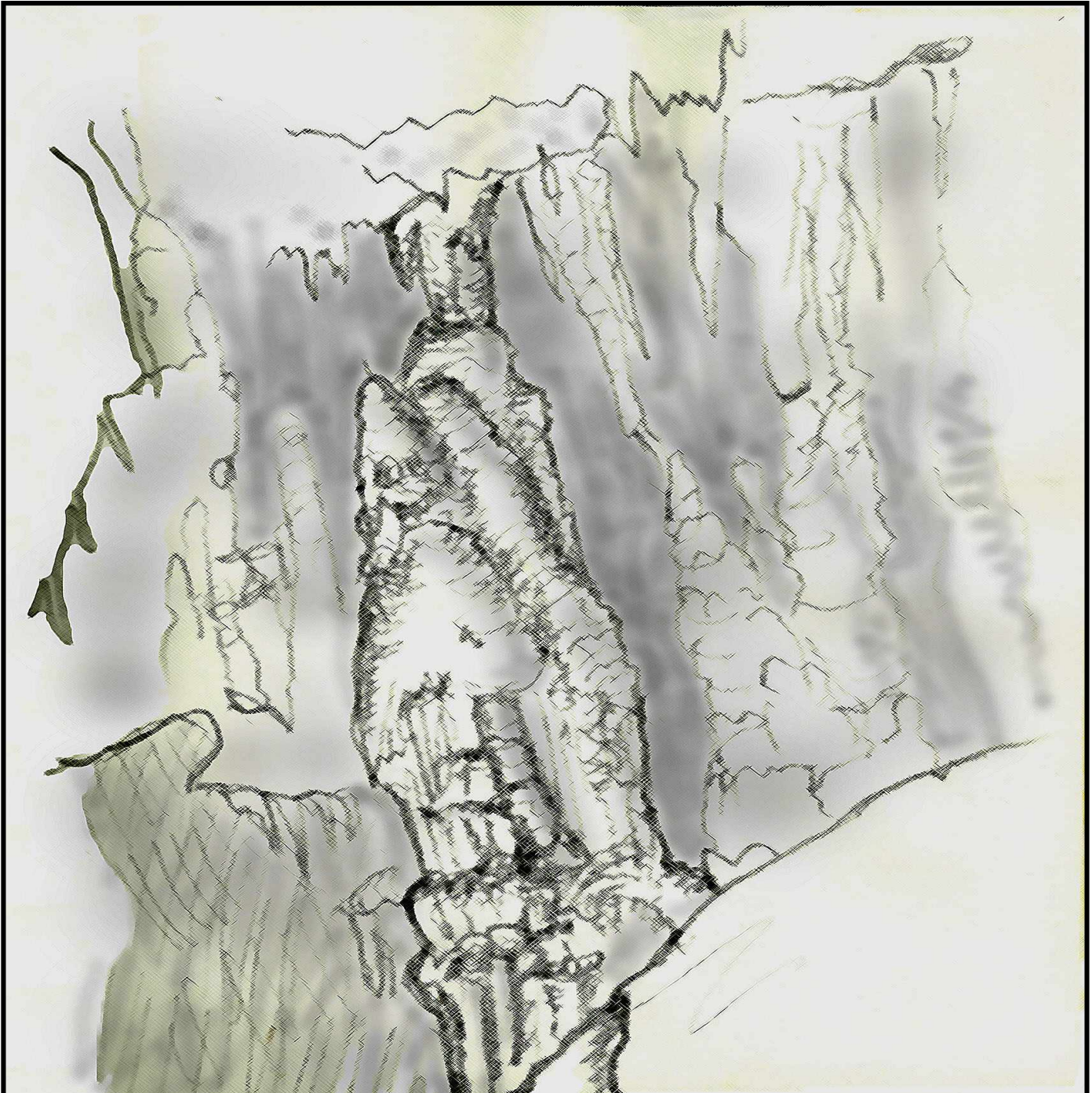
This is a drawing of an off-trail area of Endless Caverns (Drawing by Donald 'Doc' Phillips)

in those caves cannot survive outside of the caves. Everything is interrelated, and the more variety that's out there--the more stable the environment is", said Hajenga.