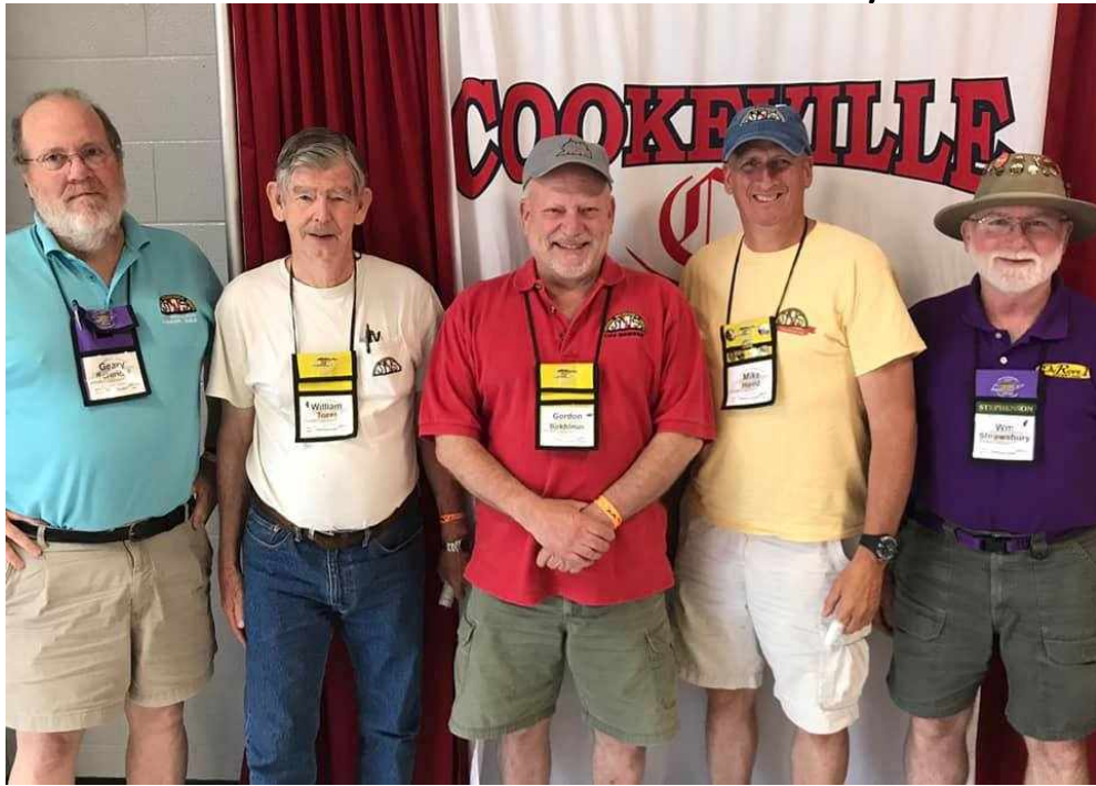
Past NSS Presidents