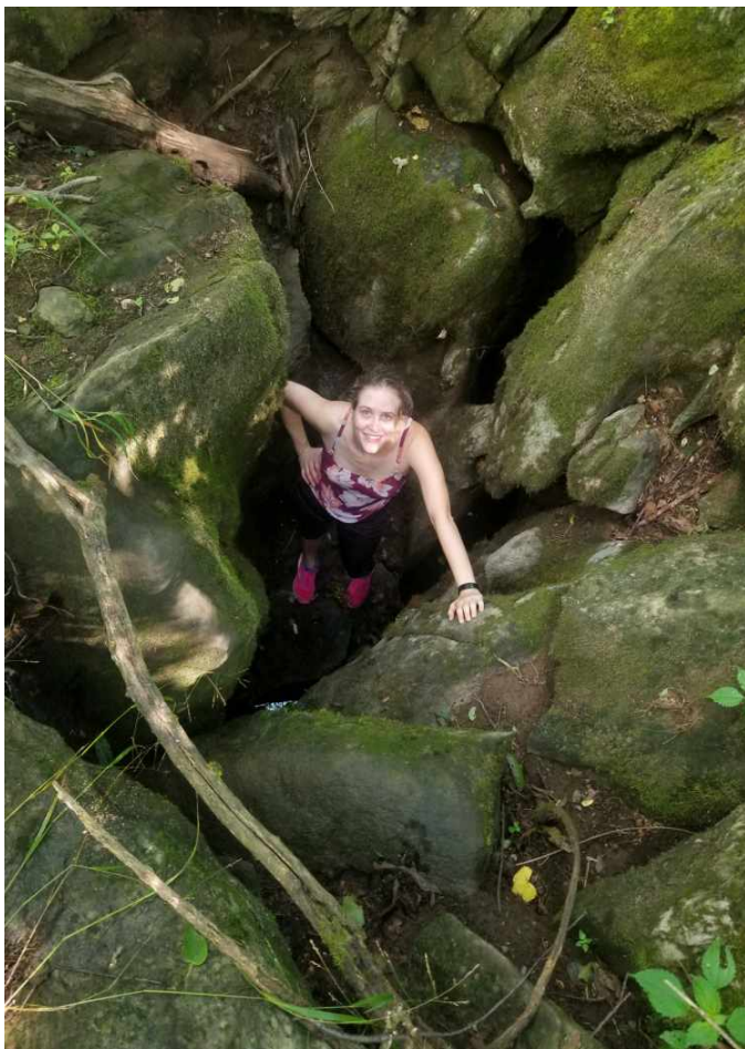
Adams Pit (Slot to right of Elysia is actual entrance)