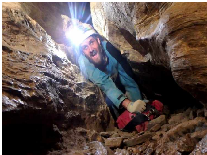
Dyers Cave