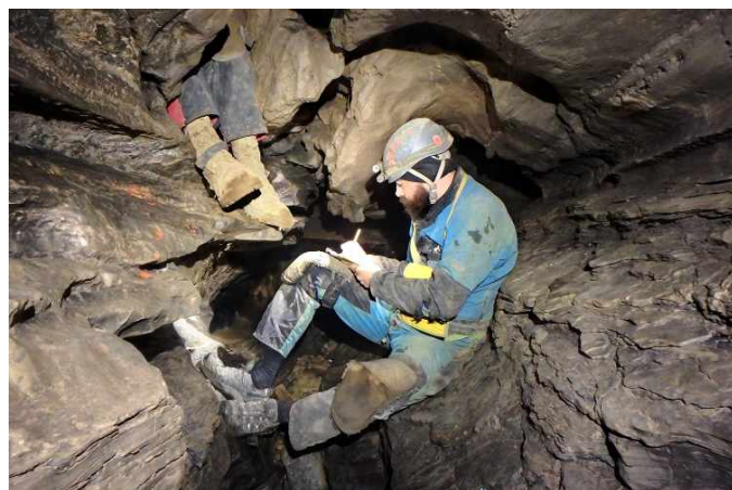
Dyers Resurvey