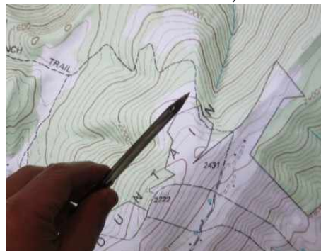
Maybe a new cave!