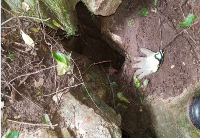
The hole at the top of the 40' pit (Tom Griffin)

after crossing this line we immediately started finding deep 20 to 30-foot sinks. We found 3 in a row with the third having a 1-foot square hole leading down. I used my DistoX to a depth of about 8 feet. After leaning over the hole further I was able to get about 15 feet. The pit Bob was looking for was 42 feet. On these days it was very hot and humid. I know I don't deal with the humidity very well, so we called it a day, still not finding the quarry.