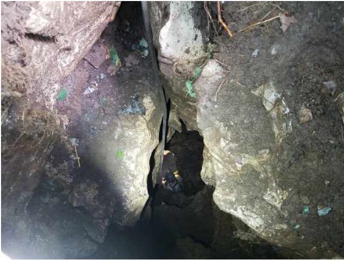
Looking 40' down at Dave in Santos Chimney.

TSG still continues to be in pretty good prestigious company!!!