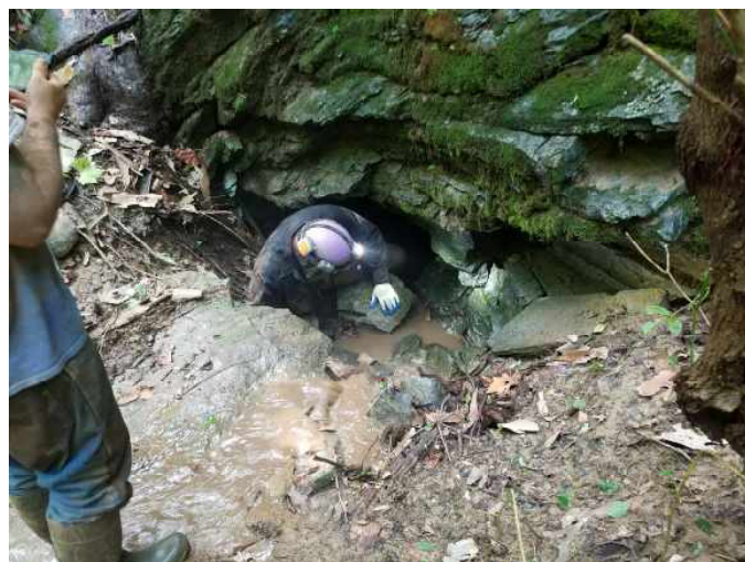
Cascade with Tom entering (Bob B)

limestone wall and circled back into the wall as if it was making a big circle.