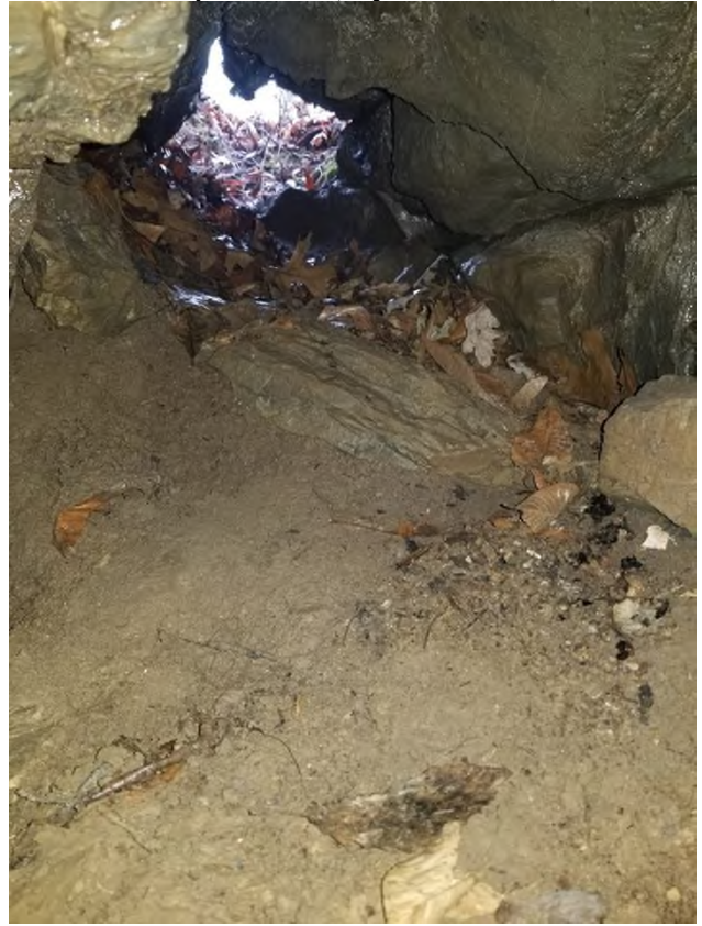
Sinkhole Cave