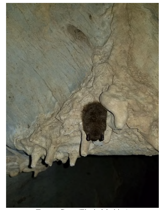
Teapot Cave