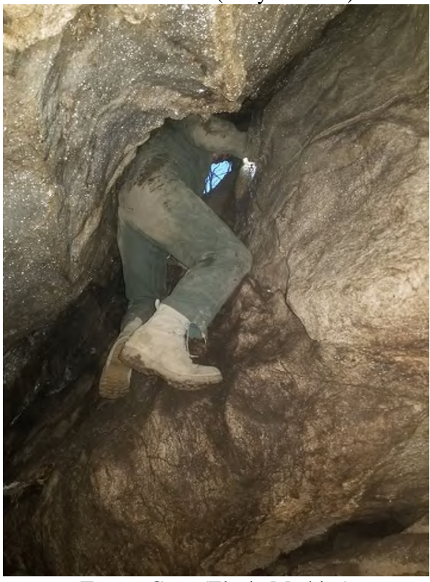
Teapot Cave