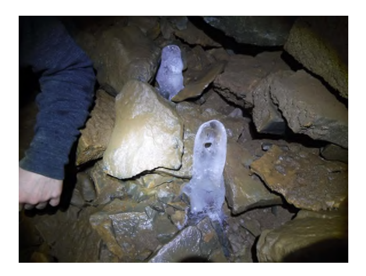
We checked out some other passages in this area, then turned our trip and started back to the known entrance.

As we made it to the top of the slope by the entrance, several people lead by Phil climbed into the other side of the loop-around passage. They wanted to see how far they could get that way. They didn't get too far, as in a few minutes they popped out from a side passage about 15 feet lower than the one they went in.