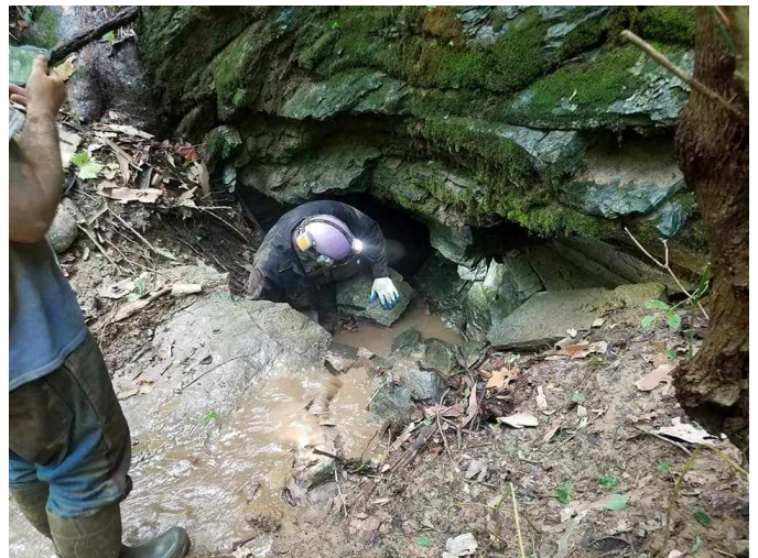
Tom C crawling into Cascade (Bob)