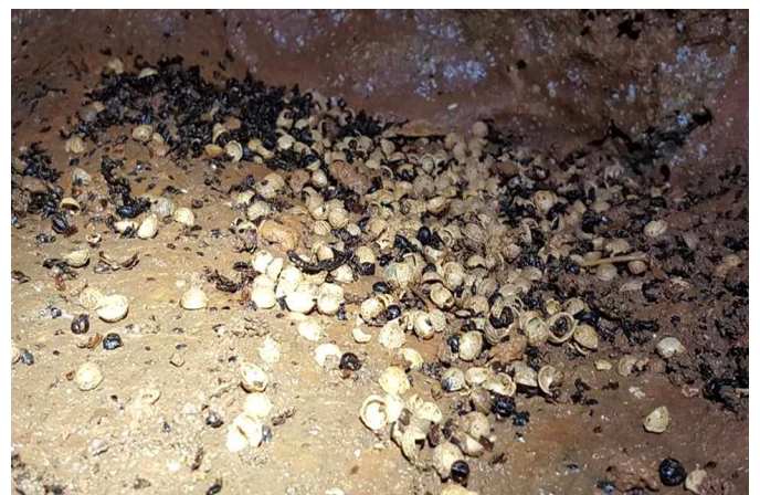
Cascade (Dave from the Cave)