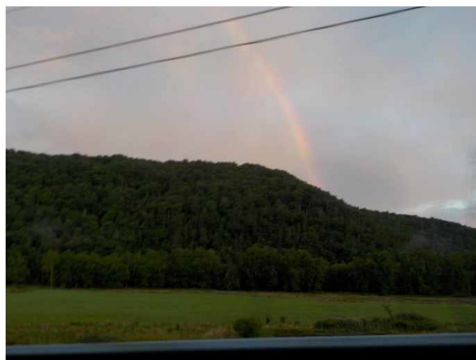
Beautiful rainbow after the rain