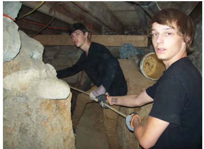
Two of the young men pulling a bucket