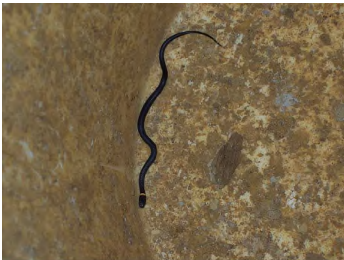
Our "Four-foot long" snake. A Northern Ring-Neck Snake

During this time as buckets of dirt were coming up, a bucket came up with a ring Neck Snake in it. Of course, everyone wanted to take a picture of it. We kept it in the bucket to show it to Keith when he came back.