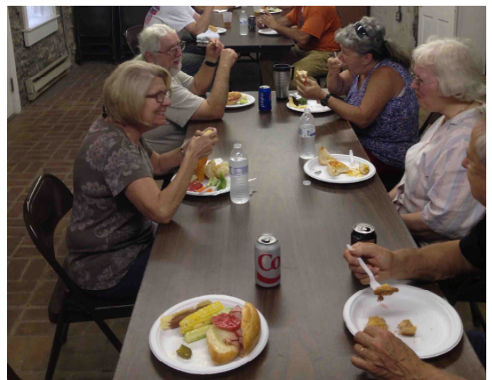
Our Lunch time crowd