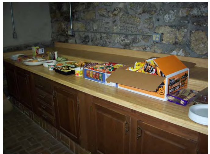
Keith's lunch spread

We worked till lunchtime then knocked off for the day. Tom pulled the Wacker out as he came up. We left everything else as is as we went to lunch.