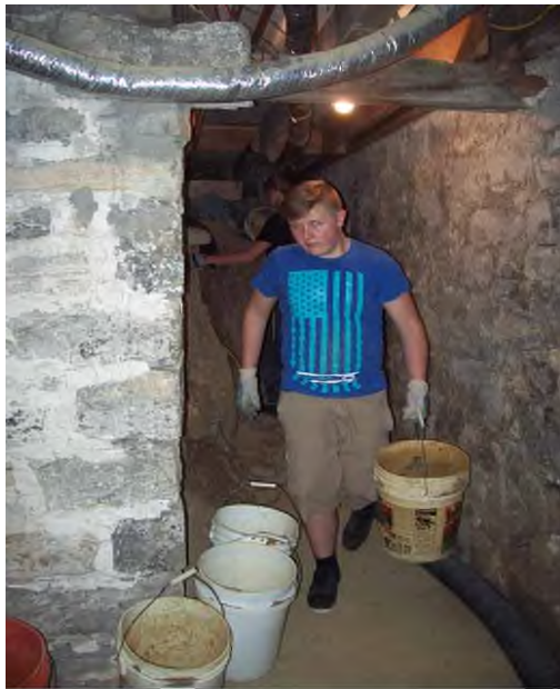
One of the young men taking out a bucket

During this time as buckets of dirt were coming up, a bucket came up with a ring Neck Snake in it. Of course, everyone wanted to take a picture of it. We kept it in the bucket to show it to Keith when he came back.