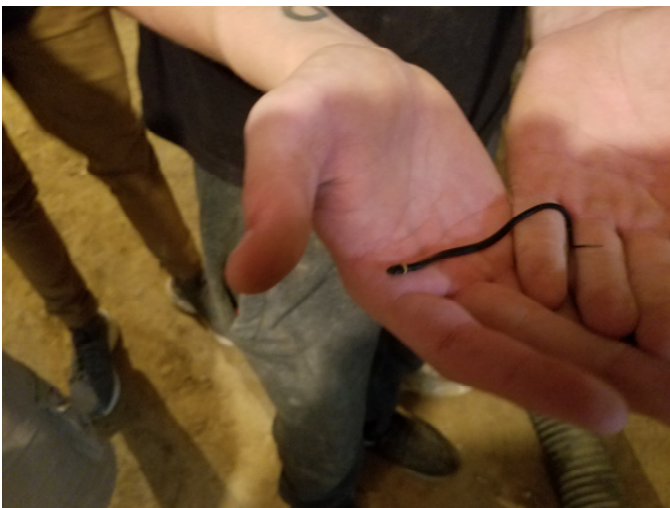
Ring neck snake

We had 7 Volunteers working the dig today. We took out 35 buckets of dirt and one bucket with a snake. We will look to do this again in the first quarter of 2018.