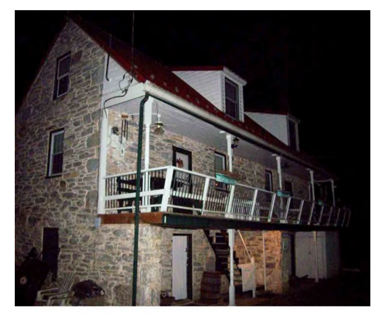
Nearby is an old stone house

on the outside of the house. She asked if I could take a picture as her battery ran out on her phone.