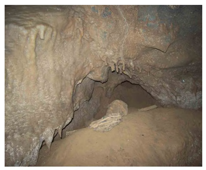
Looking down a small side passage

I stopped at the guard shack again and told them we were done, and that I was the last one out. They thanked me for letting them know why we were there and that we were finished. I thought as I walked away, it was better telling them that we were caving instead of the state police.