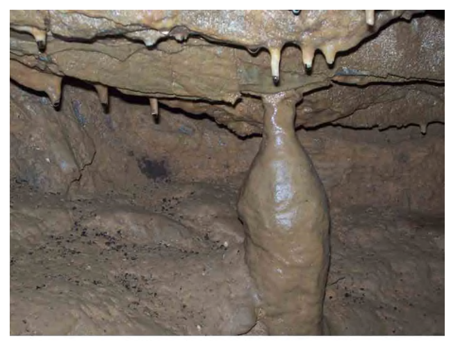
This formation has the shape of a coke bottle

When I said "climbed in," I'm talking about a twenty-foot belly crawl until you can rise up to your knees and crawl. I had Beau stop a few times as we crawled along to let people catch up. It takes time to belly crawl that twenty feet. As I said then, if we go too fast we'll hit the back of the cave in no time, let's make this last.