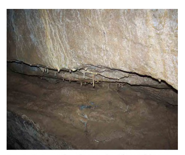
Some Soda Straws in the making

We hit the twenty-foot belly crawl and made our way through it. Outside we regrouped and moved down to the Dam # 5 caves. With the steep cliff, brush and darkness, we pointed out where they were and said this would be a better day trip. A few people did go ahead and climb up to some of the caves.