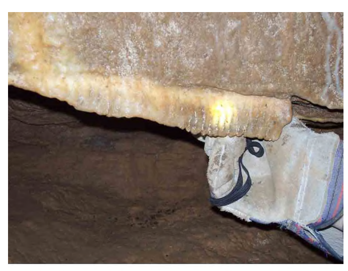
A translucent bacon formation

There were some bones found and the question was raised as to what kind they were. Were they human?