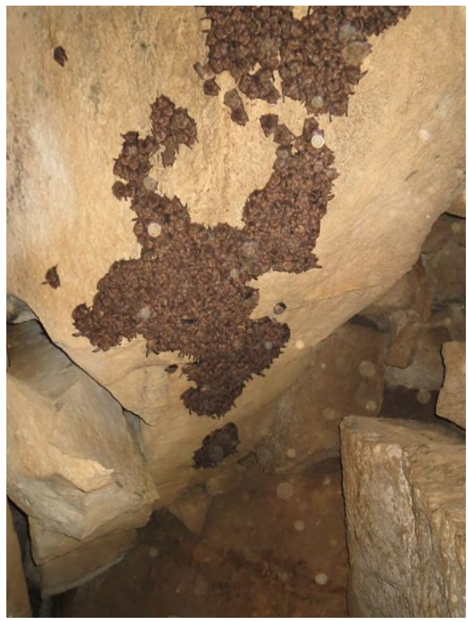
VA Big Eared Bats