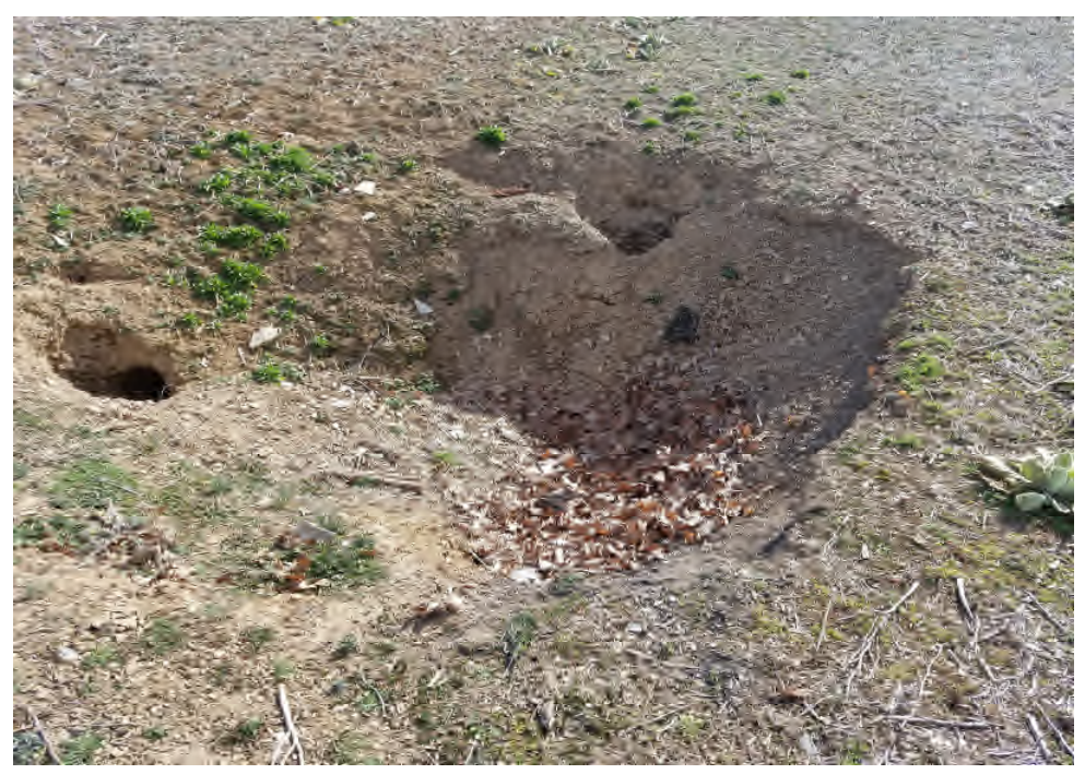
Duffys Cave sinkhole