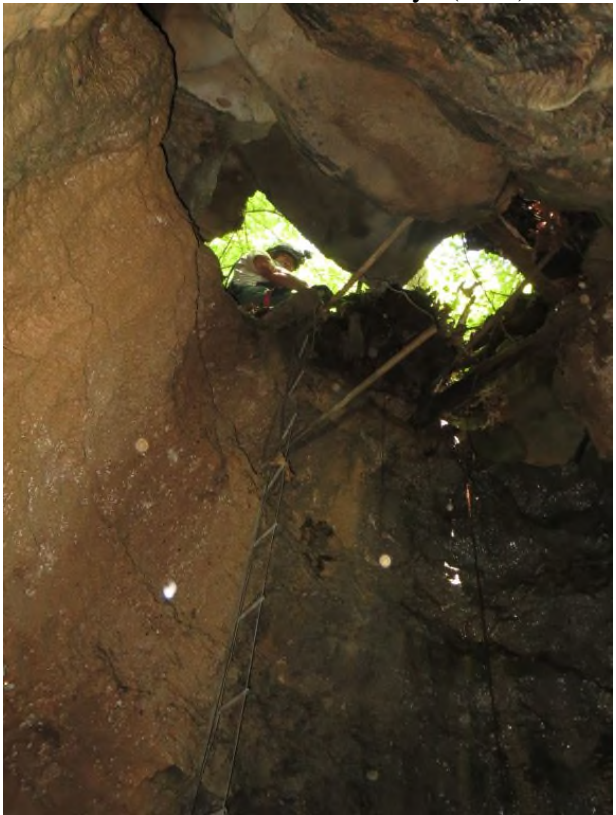
Bongo or Drum Pit (Jeff)