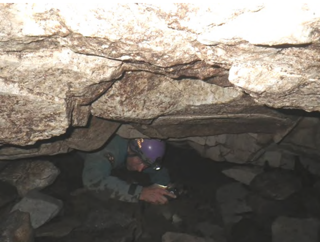
Snyder Spring Cave