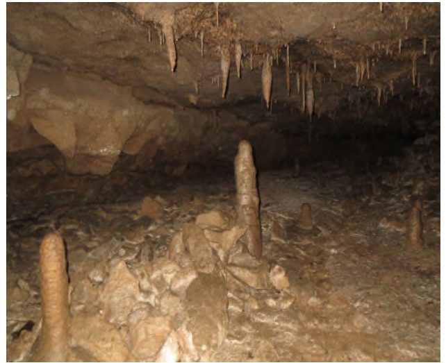
Bongo or Drum Cave (Jeff)

The 5 of us went out on this very warm day, we were shown 5 different sink holes on the property. We made entry in 4 of the holes. One being about 8 feet deep, barely large enough for one person. Another about a 3 foot by 4 foot opening that led 19 feet straight down. The hole immediately opened up to about 8 feet in circumference for that 19 feet. At the bottom it was like an upside down mushroom approximately 40 to 50 feet leading from the 19 foot dome to about 4 feet gradually leading to a pinch 25 to 30 feet away in all directions.