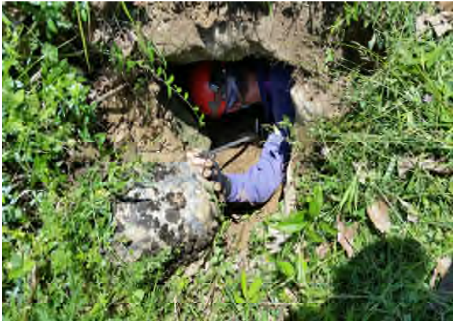
Jeff squeezing down into Snyder 8' pit (BB)