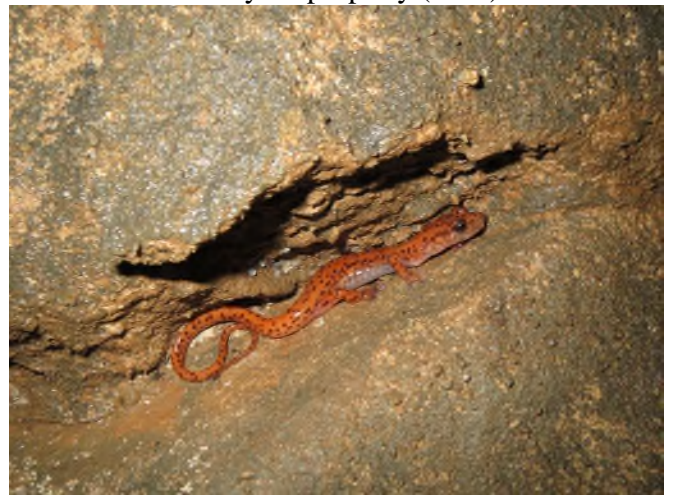
Salamander in Drum (Bongo) Pit (Jeff)