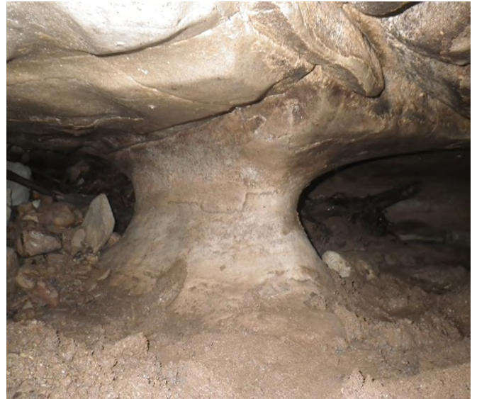
Snyder Spring (Tom)

As we made our way down to a silty level which was about 30 feet from the surface at this point, Terri moved a few rocks out of the way so I could slide down in the bottom where the cave went in 3 different directions. To the right it went for about 14 feet then stopped. 2 passages to the left that led through a small pond of water then led to 2 turns. These still need explored. Total linear feet of passage found here was 83 feet.