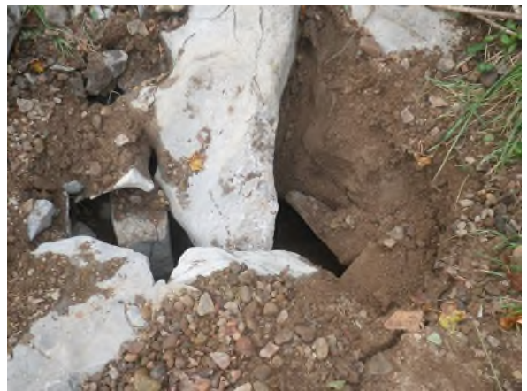
The Geyser (Tom)

We checked out the geyser sink. This time we could see down through the heavy stones a couple of feet, before all we could see was sand and gravel. Our next trip out we will hopefully get to see what's below.