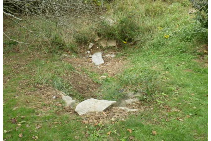
Sink where 4' high geyser bubbled up during flood on Snyder property (Tom)