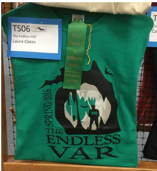
VAR T-shirt received honorable mention at the NSS Convention

We walked back to the vehicles and redressed. As one of the guys pulled out in his pickup, the water poured out of the bed. It must have really rained hard while we were in the cave. We had hoped to do both caves, but it was so late, we headed home. We didn't get home till after 11 pm. Everyone had a good time.