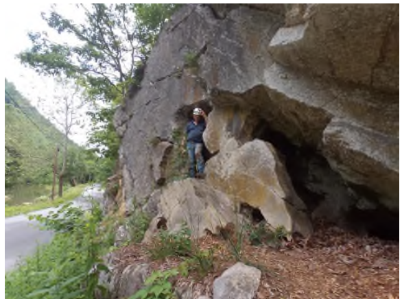
McCoys Mill Cave