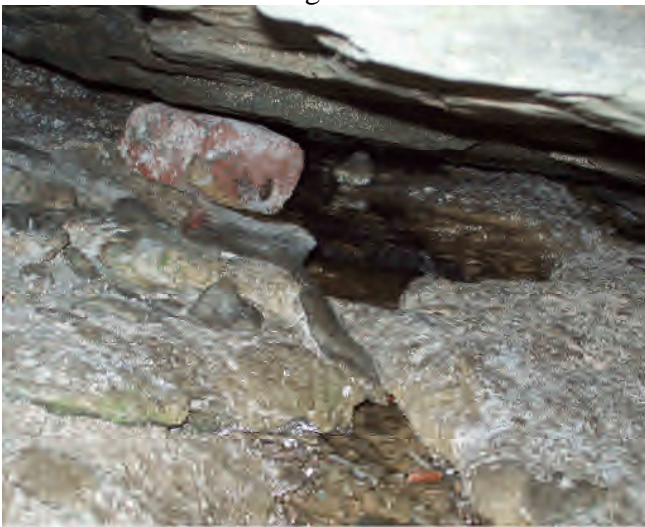
The spring that is left of the center spring

There was sediment dirt on the floor. Unfortunately we didn't have Doc's needle to probe the floor. I'm guessing it may have had shelves to set things on to keep cool. It would be neat to dig out the floor. Who knows what we might find.