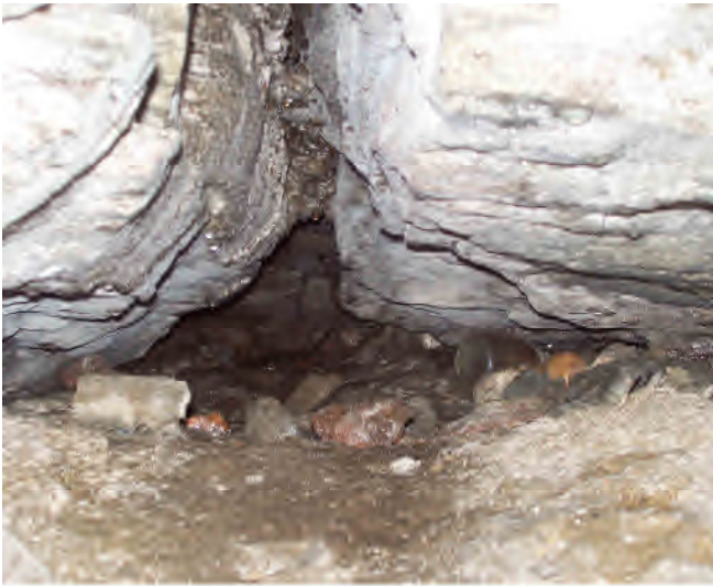
Looking up the left corner spring

There was sediment dirt on the floor. Unfortunately we didn't have Doc's needle to probe the floor. I'm guessing it may have had shelves to set things on to keep cool. It would be neat to dig out the floor. Who knows what we might find.