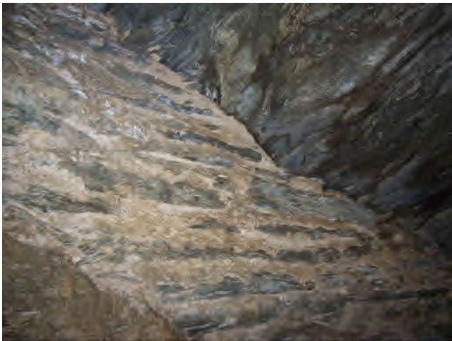
Stonework at a high spot in the back

We were there to check out Potomac Grill Shelter. We met up in a group and climbed the hill. Soon we were inside the cave. Looking around we could see that someone had done some masonry work in places in the cave. The way the rock laid, it looked like the cave was modified.