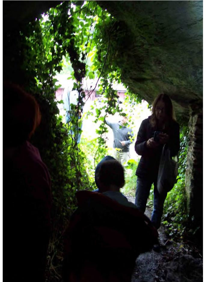
Looking out of the opening of the cave entrance, you can see the Harpers Ferry Train Station

There was a pool in most of the Cave. It had at least four springs feeding it. At one time there was a gate on the cave. It has been removed and is in the Potomac Grill.