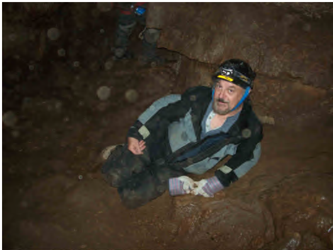
Doc taking a break

We took turns going up the drop. Tom had to help me get my gear straight. After everyone was up we pulled up the rope. One by one we headed down the passage to the main entrance. Climbing out we were hit with high humidity, and could tell it had rained while we were in the cave.