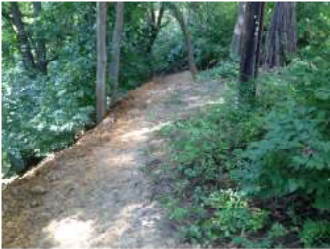
From the right, this is how far we have extended the hillside

After carrying the buckets out, they are dumped over the hillside. Over time we have extended the level area out several feet.