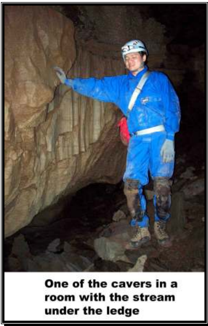
One of the cavers in a room with the stream under the ledge

There was a couple with us, where the guy had a new GoPro camera attached to his helmet. I hope sometime in the future I run into them again to see how the camera did.