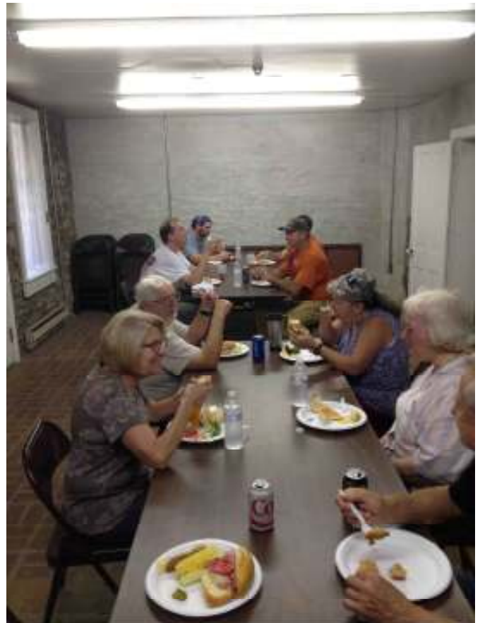
Our Lunch time crowd

Last dig we had taken out 81 buckets before lunch. Everyone wanted to reach that number before we broke for lunch. We stopped at 12:45 with 84 buckets.