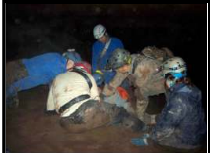
Someone dropped a candy bar. ( They're looking at a map )

Sliding down slick mud banks, we made our way to a pond at the bottom. It had a slow counter clockwise turn to it. The water was falling down through a siphon. We took the opportunity to look over the map before climbing back out.