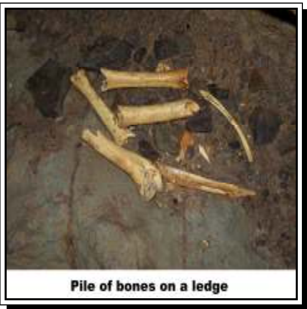
Pile of bones on a ledge

We parked in the parking spot and suited up. We had to cross the road and a dry streambed. Climbing up the hill on the other side, we ascended until we made it to the entrance to "My Cave." Taking turns we dropped into the cave. We passed a pile of bones and I had to take a picture of them.