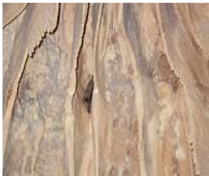
Jones Quarry (Ton G)