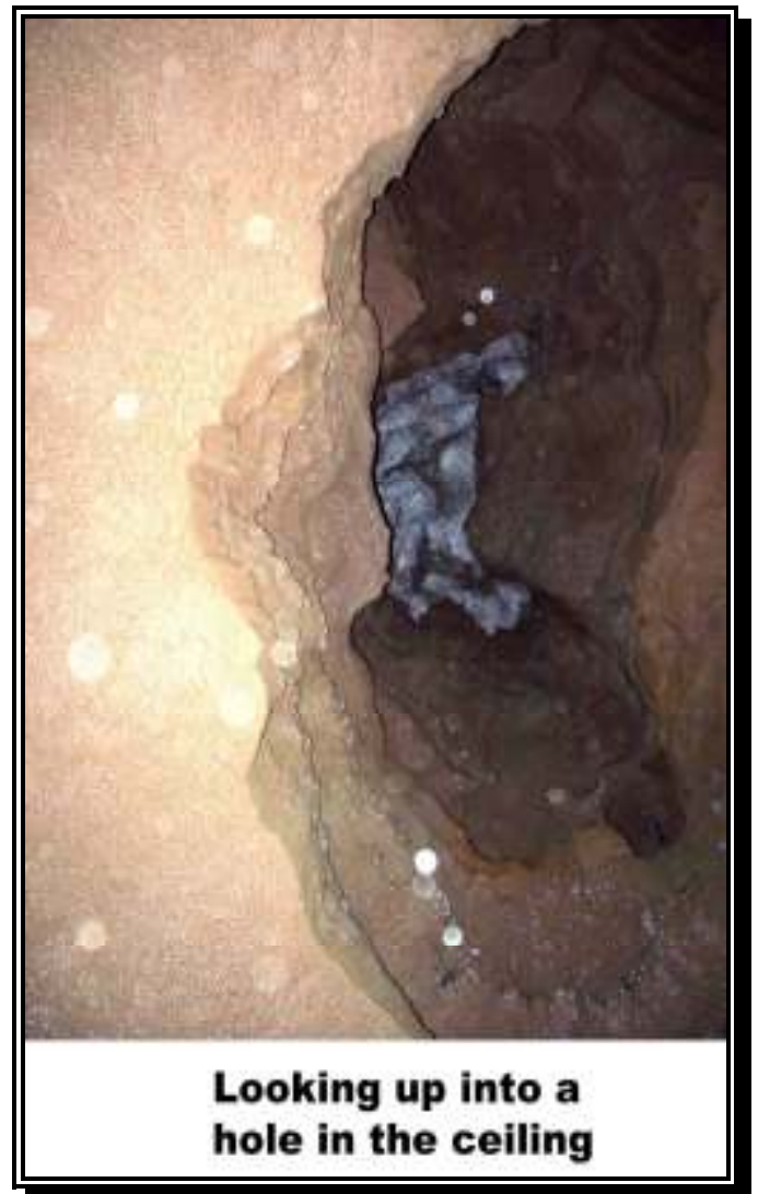
Looking up into a hole in the ceiling

Passing the bone pile we caved our way down the passage. Looking up there were nice things happening on the ceiling. There were holes that let us see higher up, with some nice pretty things going on there.