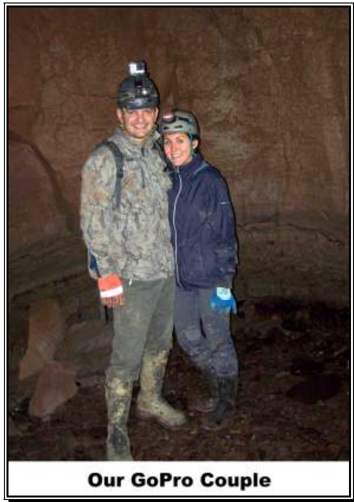
Our GoPro Couple

There was a couple with us, where the guy had a new GoPro camera attached to his helmet. I hope sometime in the future I run into them again to see how the camera did.