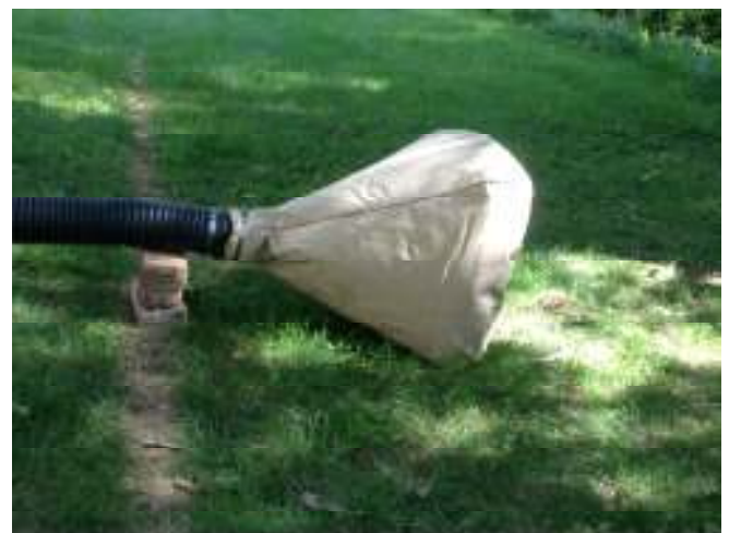
Fan bricked up for air flow