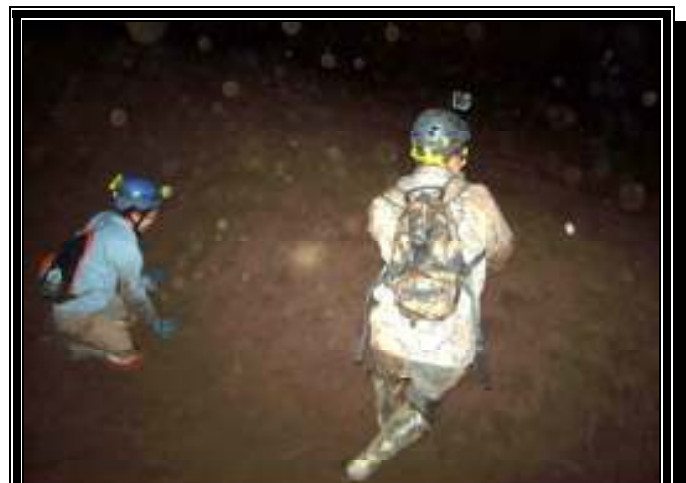
Trying to climb out of the trough and sliding back down

Climbing back out we had to follow footholds dug into the clay bank. Even with those it was a hard climb out. There wasn't always foothold and you just had to go for it. Sometimes you didn't make it and you would slide back down.