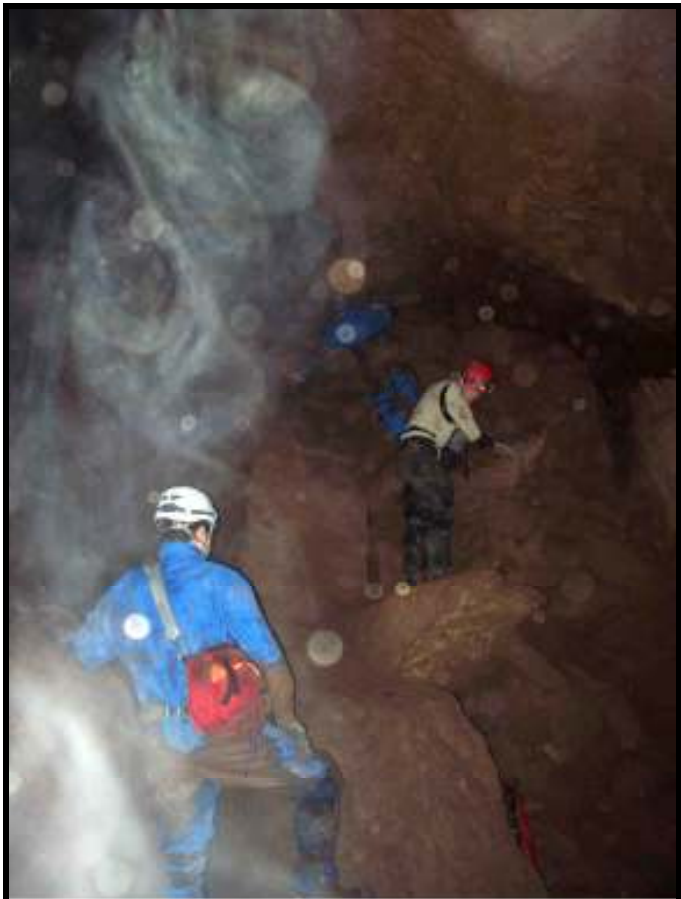
Climbing up some breakdown

We arrived at Razor Pit and took turns looking down it. It had a lot of sharp edges. It had some good colors too.