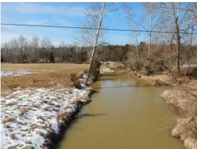
At the back of the picture is a spring called Boiling Spring where most of the drainage in the south end of the county comes out in the Mill Creek (Dan D)