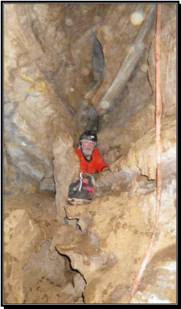
Lower Nestle Quarry (TG)