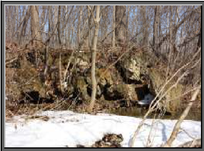
Tufa at Once Upon A Cave (BB)