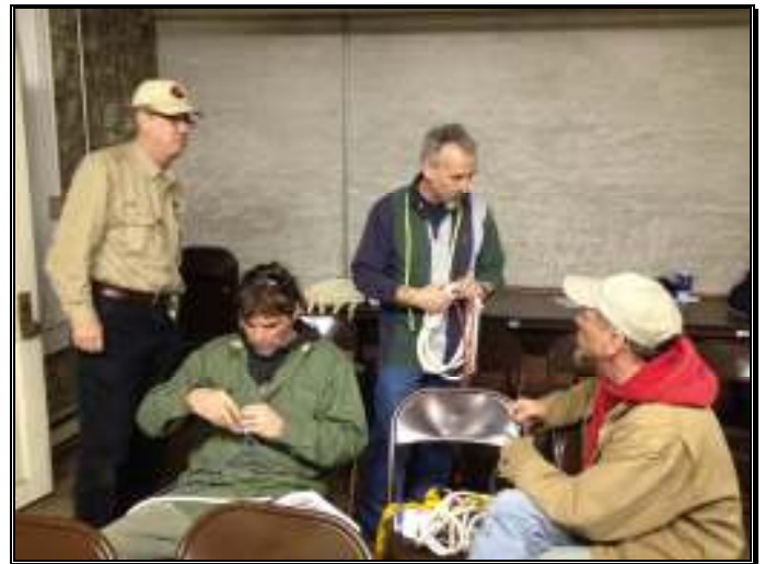
Teaching knots at the TSG meeting