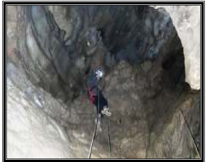
Whitings Neck (TG)