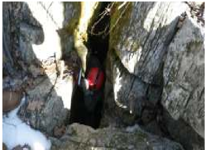
Upper Nestle Quarry (TG)