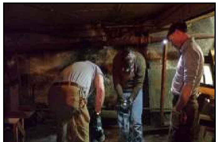
Assault on the Apollo