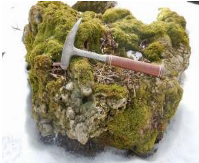
Tufa at Once Upon A Cave (Dan Doctor)