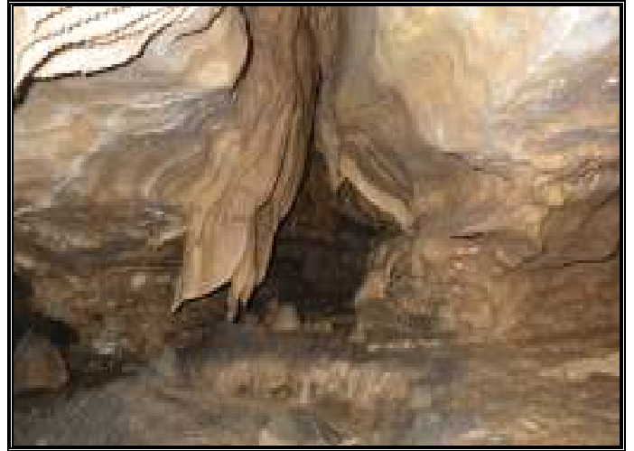
Lower Nestle Quarry (TG)