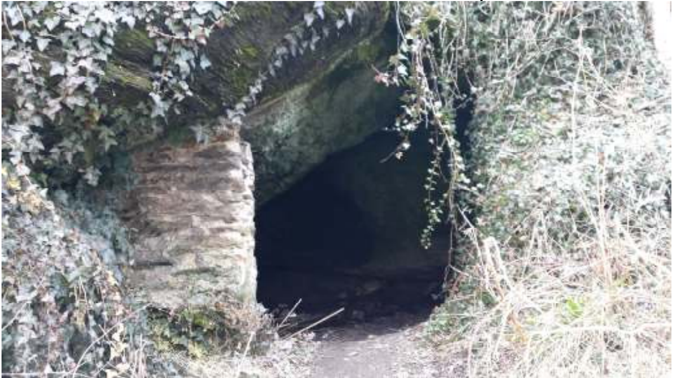
SHELTER IN HARPERS FERRY, WV (BB)