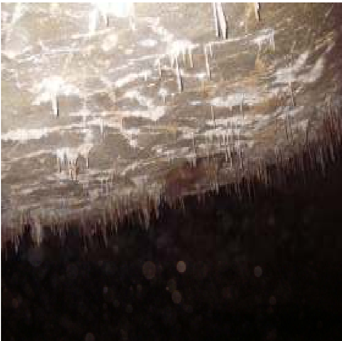
A nice shot across the ceiling

There are a lot of neat formations in this room. You had to look around.