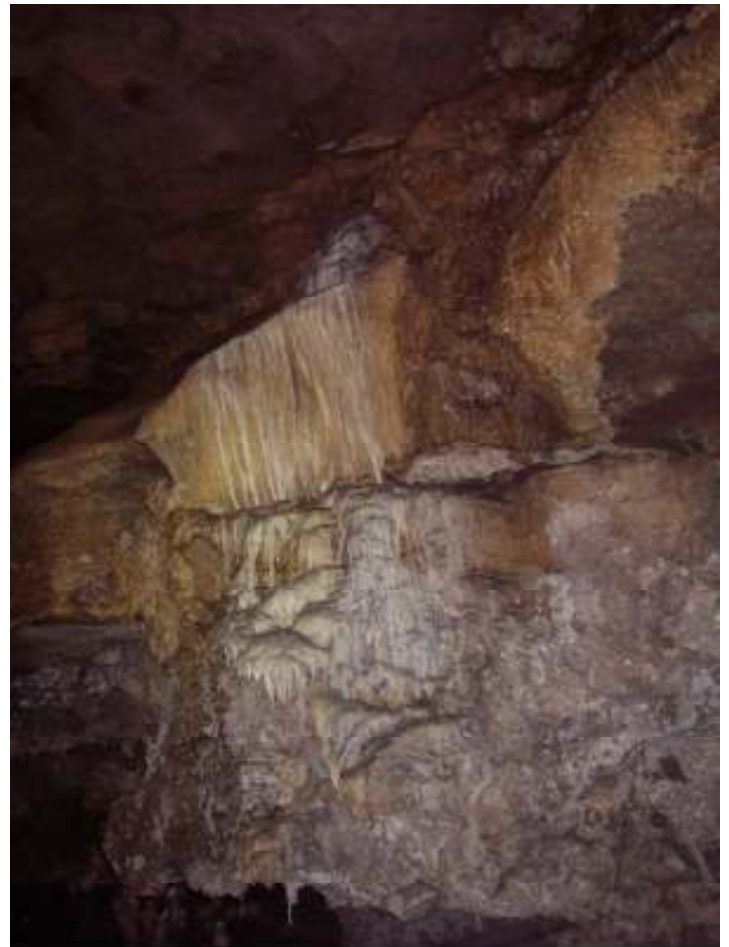
A pretty flowstone wall