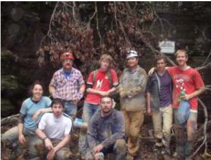
After shot. Who's dirty now?

Races to the intersection with Flowing Springs Road. Detour signs redirect motorists around Fifth Avenue. Access to the casino and race track is not affected by the sinkhole or the detour.