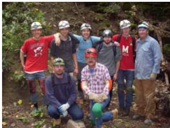
Before shot. What a clean bunch. No danger of spreading White Nose here.

We arrived at the cave and parked across the road. Suited up, we headed up the trail. Arriving at the cave we climbed down into the sinkhole. I had been here previously, and the entrance was just a window with a gate. Now, it has a gate made out of pipes that you climb through, with rebar steps. Porters Cave has two sides. When I was here before, we went right. This time we went left.