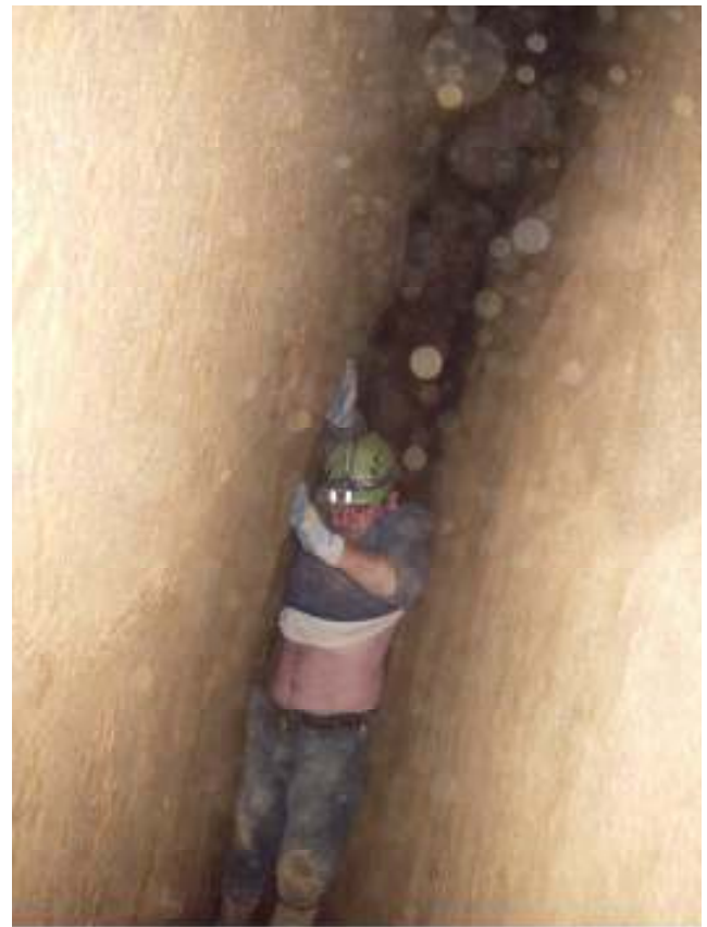
Todd Zimmerman sliding down the crevasse.