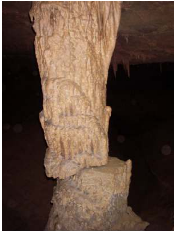
Could this have been from an earthquake many years ago?