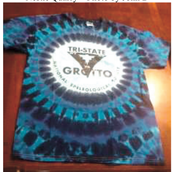
New TSG T-shirt