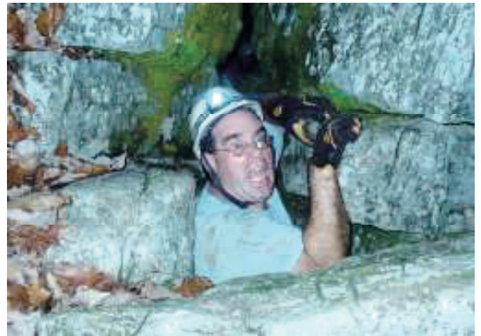
Nestle Quarry