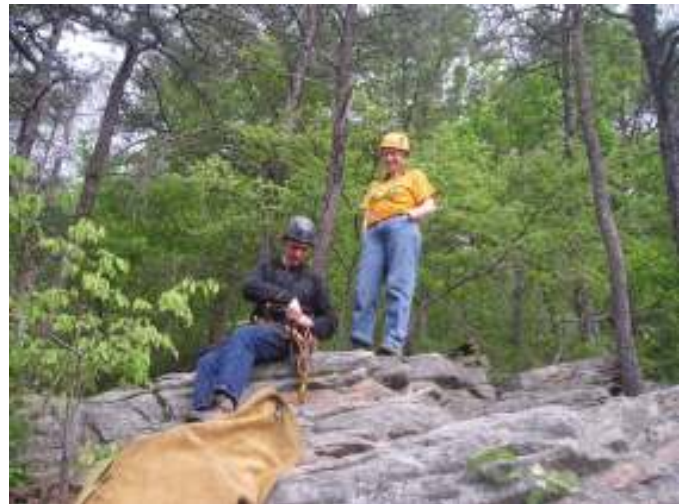
The last 4 photos were taken by Tom Griffin