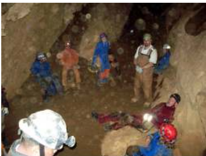
Part of our group in the first room

We climbed a clay bank, then slid down a rock to follow the passage. There is another low spot that dropped down to the main passage.