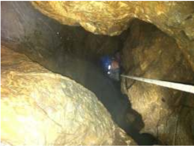
Myers Bridge – by Tom