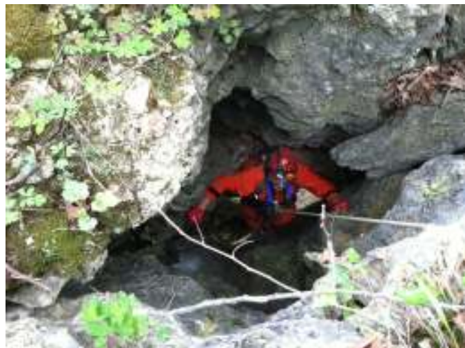
Devils Chimney