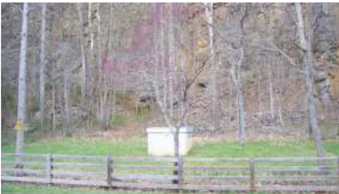
Pump house by Blowing Cave that we parked near

Arriving at the Blowing Cave, we parked across the road from the pump house.