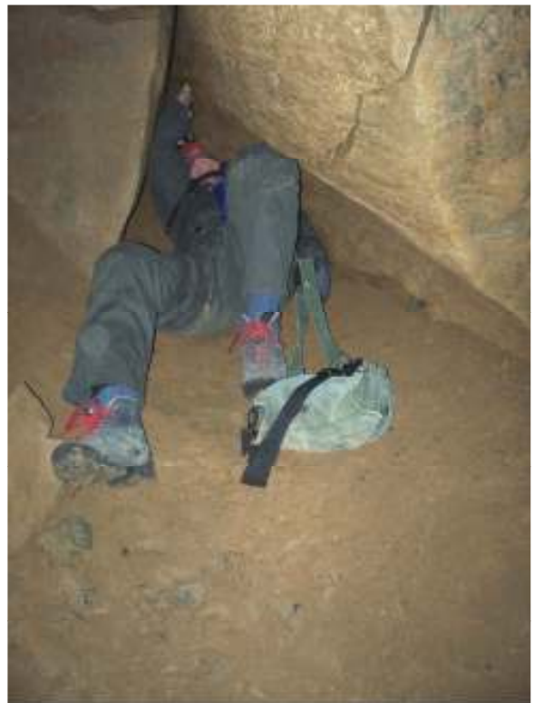
Squeezing through the first constriction.

As soon as you start in, you are headed down into the cave. It drops 30-40 feet before you hit the tight constriction in the cave. Lying on your back, you go headfirst. I kind of walked with my shoulders and went in fairly easy. Of course it was slightly down hill.