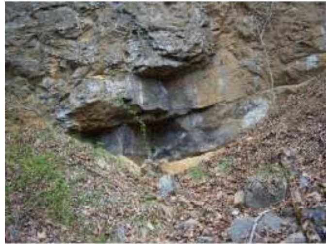
Entrance to Blowing Cave

As soon as you start in, you are headed down into the cave. It drops 30-40 feet before you hit the tight constriction in the cave. Lying on your back, you go headfirst. I kind of walked with my shoulders and went in fairly easy. Of course it was slightly down hill.