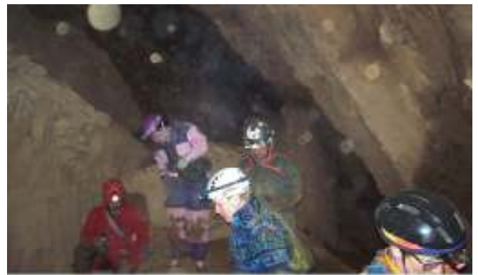
Turning around in the first room and photoing some more of our group.

We followed the passage to the first large room. Here we waited for everyone in the group. Everyone turned out their lights so we could have total darkness. We did a sound-off headcount and had 24 people on the trip.