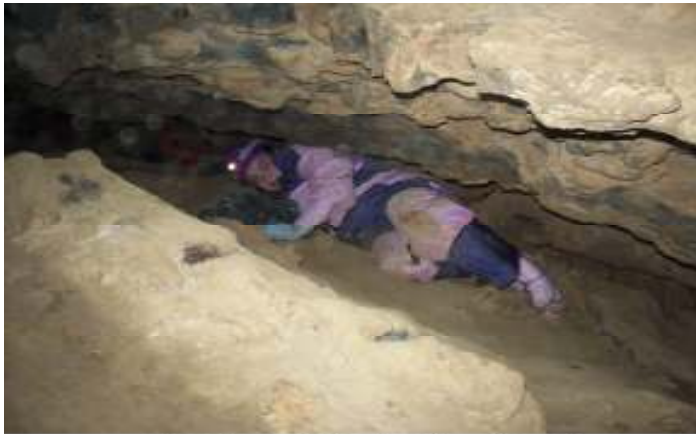
Pretty-in-pink squeezing through a low ceiling pinch.

As I reached the other side, there was a wall and I had to sit up with my legs still in the constriction. Now, I had to try and stand.