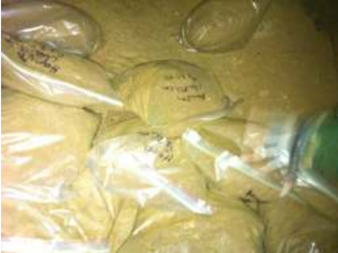
Bags of dirt (Tom G)

taken a long time ago. What is so neat about the dig site is it continues to go with a lot of different passages I have yet to explore.