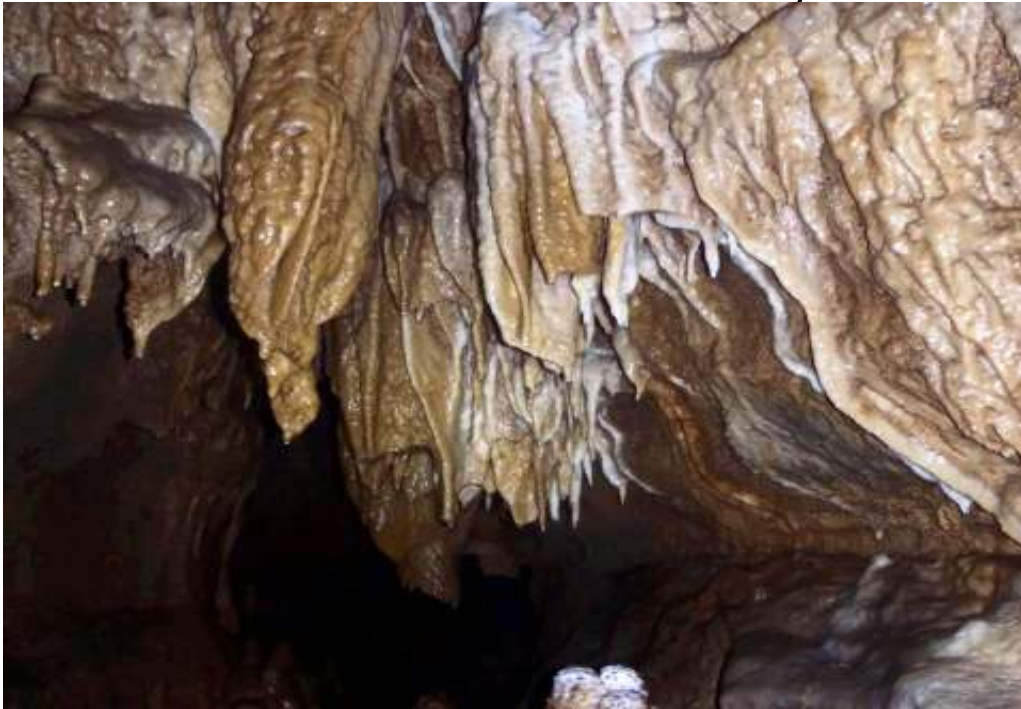
Fox Cave (Judy F)