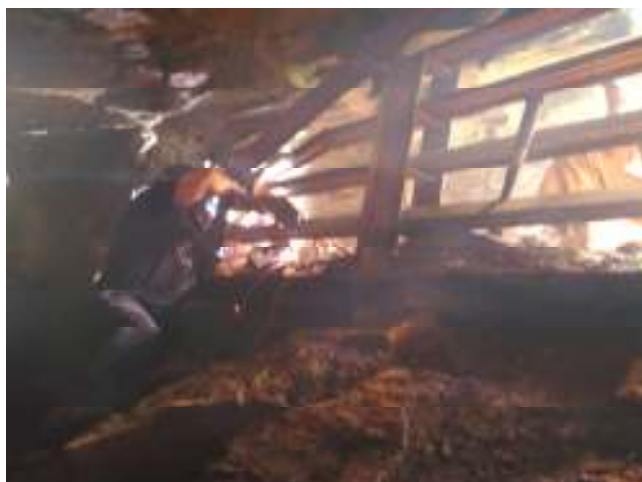
Todd welding gate on Donaldson (Tina B)