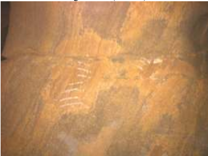
Bear claw scrapes