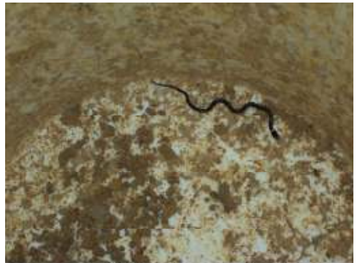
Northern Ring Necked Snake

Mating in the spring, females secrete pheromones from their skin to attract males. When a male finds a female, he rubs his closed mouth along the female's body. The male bites the female around her ring neck. He aligns their bodies so sperm can be inserted into the female's vent. Females lay 3-10 eggs in loose, aerated soils under a rock or in a rotting log. (James Yung (2000))