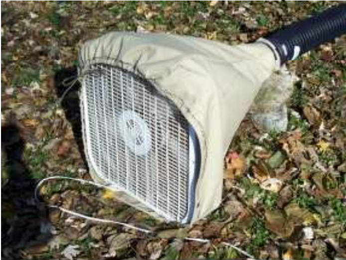
Fan with Tom's reducer connected to the black pipe.

Last time we were there we had air problems. Tom made a reducer bag to fit on a box fan and blow air through 100 feet of black pipe. We rigged it up and ran it down inside the tunnel. It made a big difference. You will see it in several of the pictures.