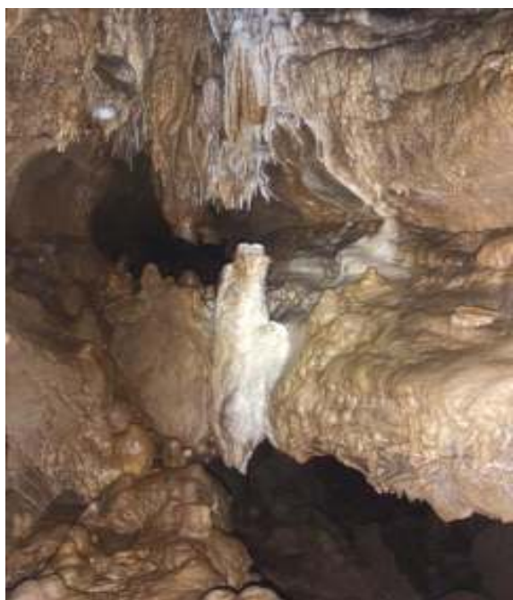
Fox Cave (Judy F)