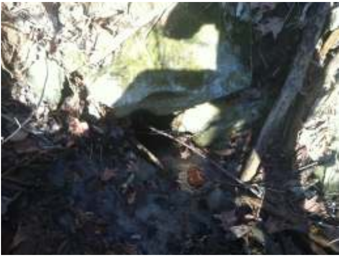
DW1.3 (15' drop)