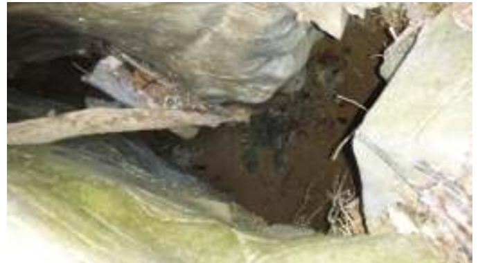
DW1.1 Sarahs Cave

We had a very productive day for our first ridge walk. We found at least 1 new cave, found 3-4 new possibilities, and GPS'd most of the known caves. Not bad for 6 hours work. Oh by the way, the temperature was about 70 degrees. It couldn't have been any better!