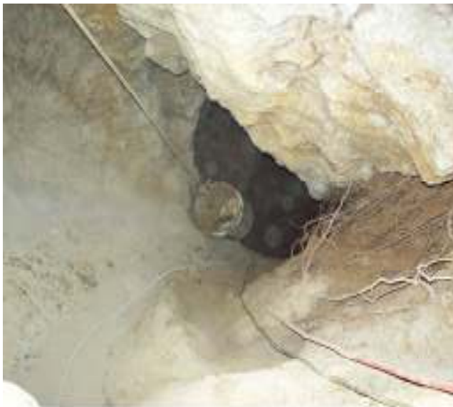
Here is a bucket being pulled out.

Martinsburg, WV -Tri-State Grotto returned to the Adam Stephen house in Martinsburg, WW to continue our dig on the "Tunnels."