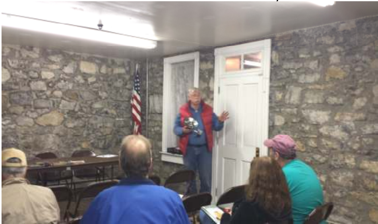
ANNUAL GROTTTO AUCTION