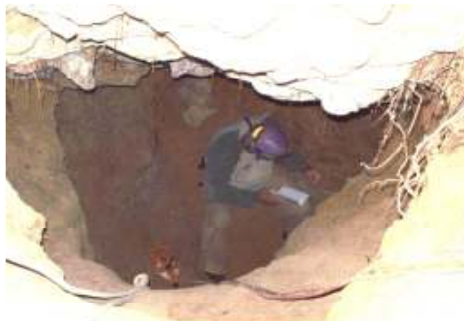
Tom Griffin surveying at the bottom of the drop.

They started outside over the dig site. Shooting their points, they moved around the house and through the side cellar door. Going through several rooms, they hit the top of the passage and headed down.