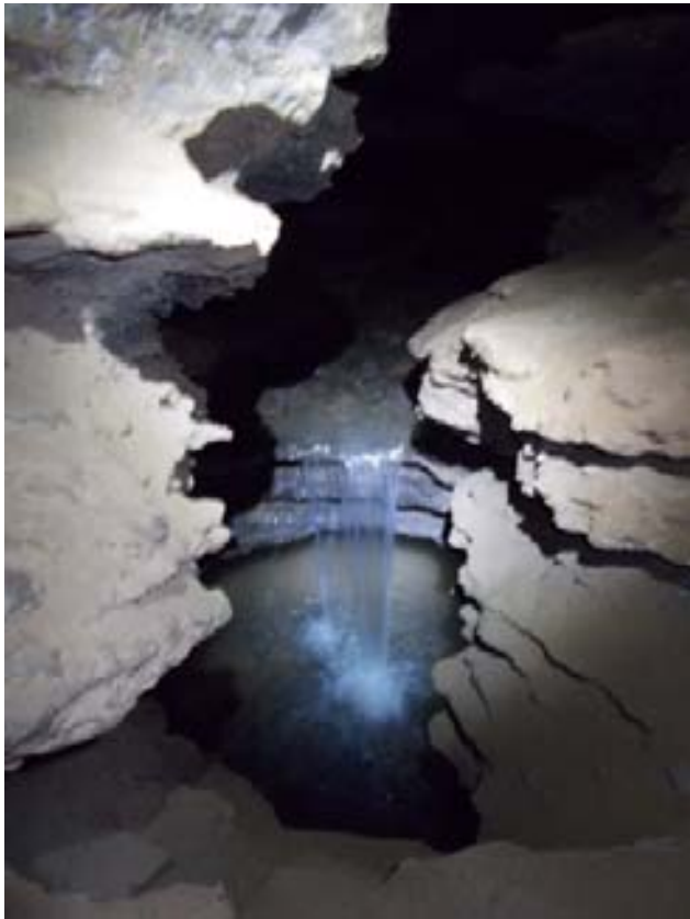
3 foot waterfall (Kysar)

the ceiling. The canyon was narrow enough to straddle in most places. There were several over-under places. Some of us were traveling the canyon way up high, while others were on the floor.