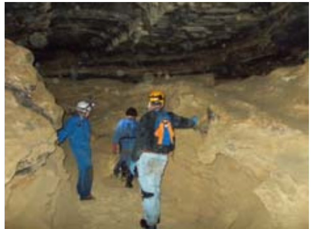
Typical passage (Kysar)

The passage goes down and then left. Pretty much typical walking passage awaits the explorer all the way to the saltpeter bridge. We all gathered around this historic spot telling about this and other saltpeter caves, why they existed, how they looked when being worked and the condition of the cave when they were done. Traveling through this cave we saw faggots laying around and it was evident in many places that the walls and ceiling were still blackened from activity long ago.