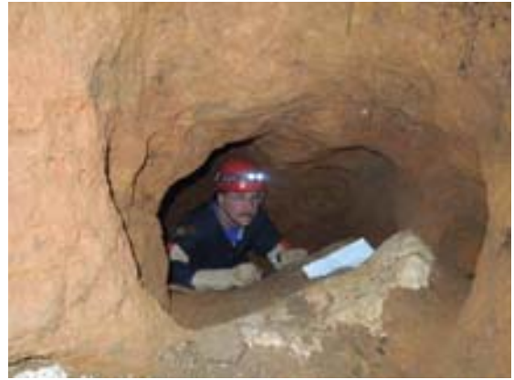
R&H Cave (Bowen)