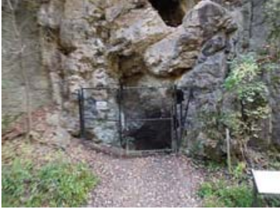
Cumberland Bone Cave (Bowen)

Purpose of the trip: Locate entrance. Jerry has been assembling information on Cumberland Bone Cave for over a decade. It was time to go out and find it.