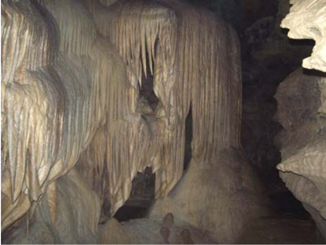
We took a side passage and saw some nice formations.