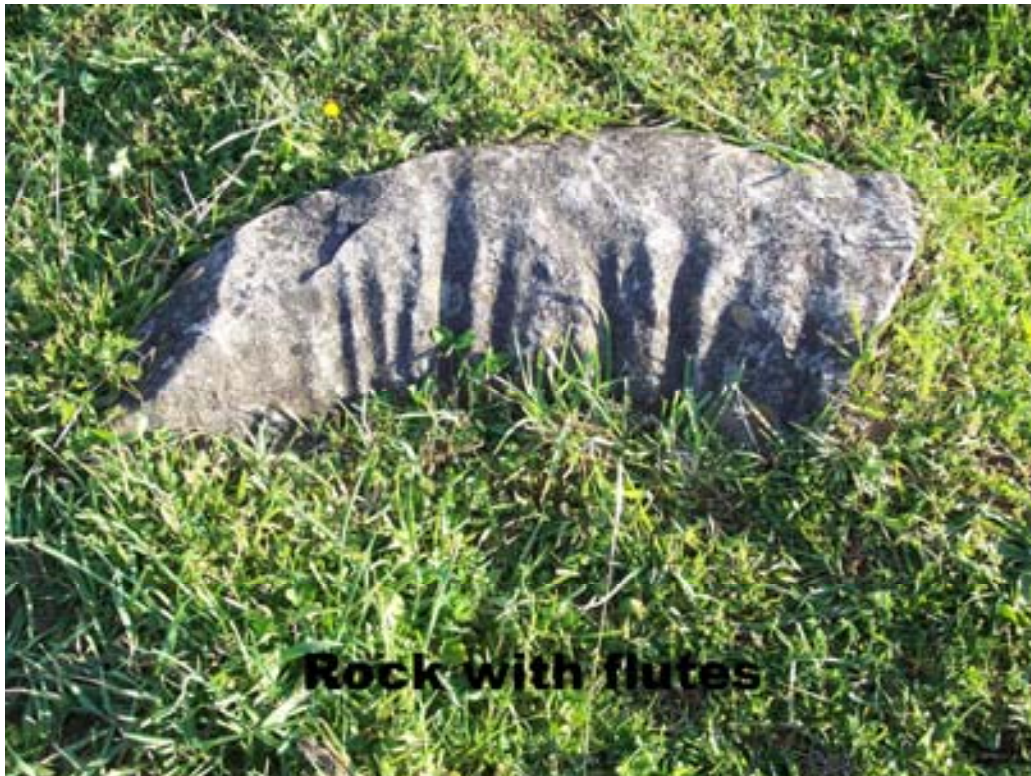
Rock with flutes