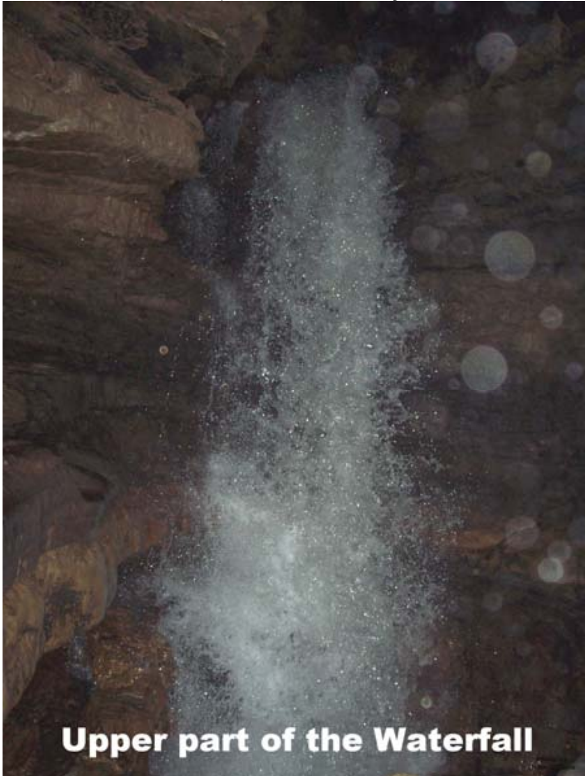
Upper part of the Waterfall