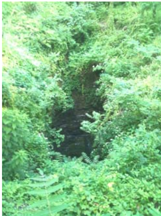
Morgan Co pit!