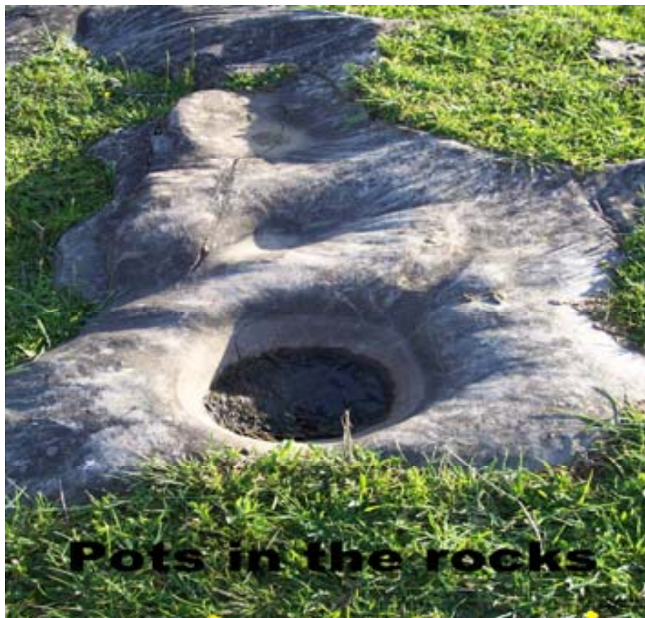
Pots in the rocks