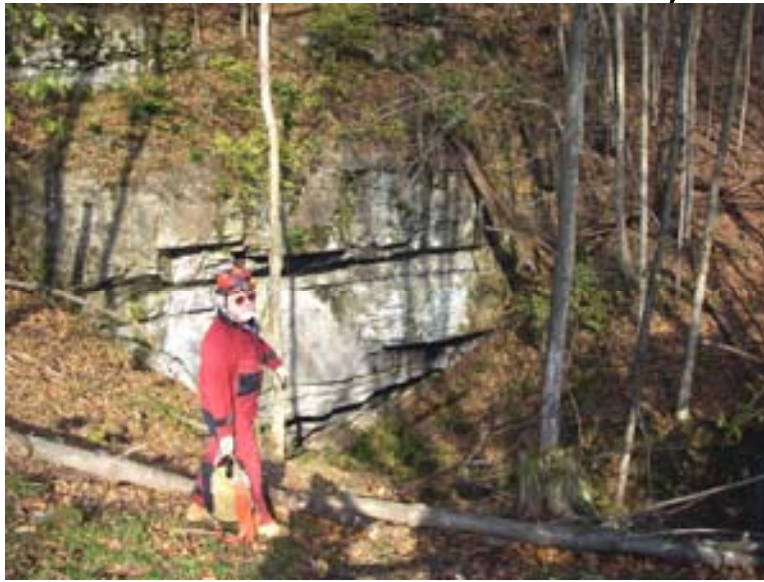
Mystic Cave Entrance (Fox)