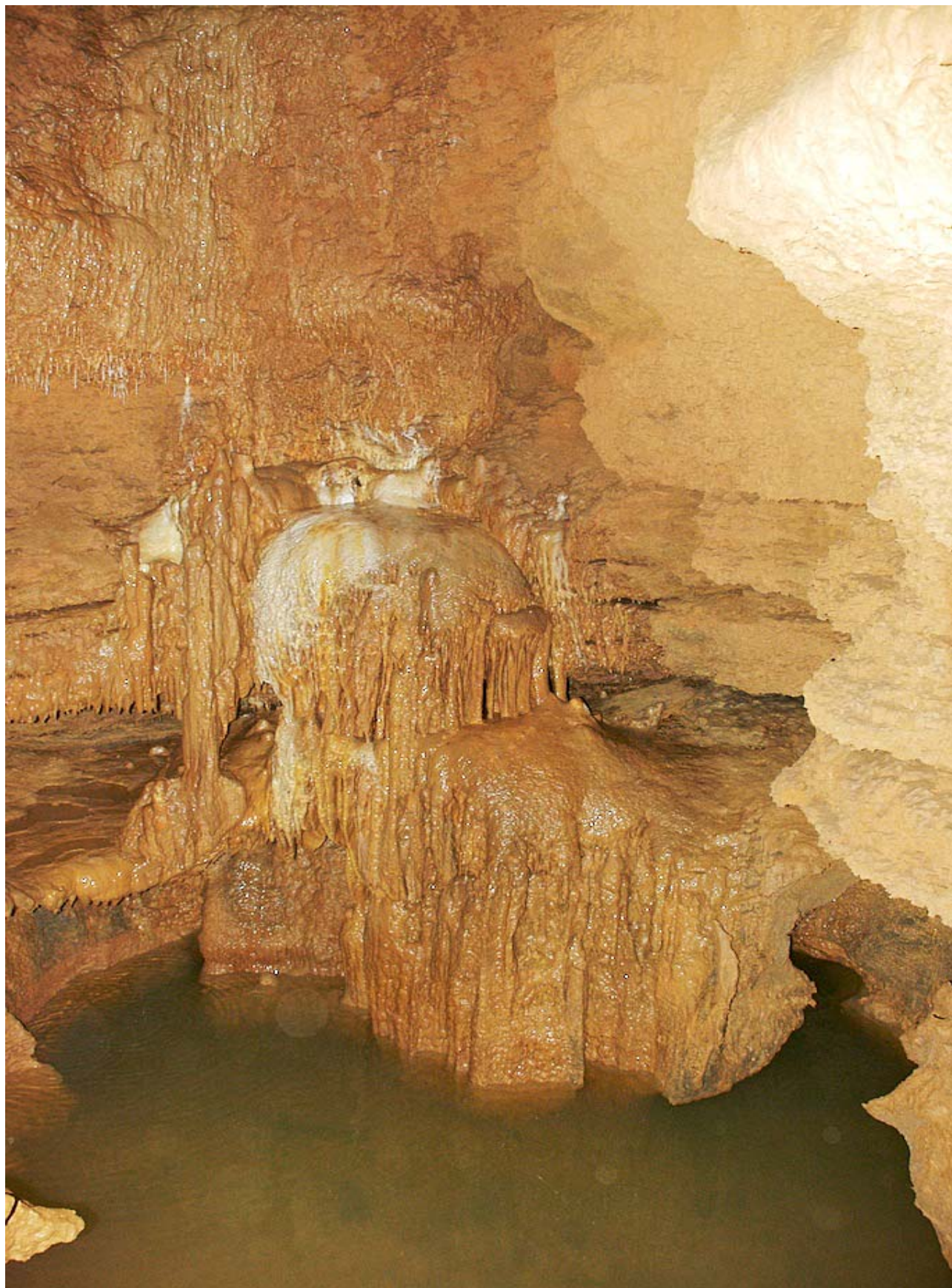
Silers Pool (Bowen)