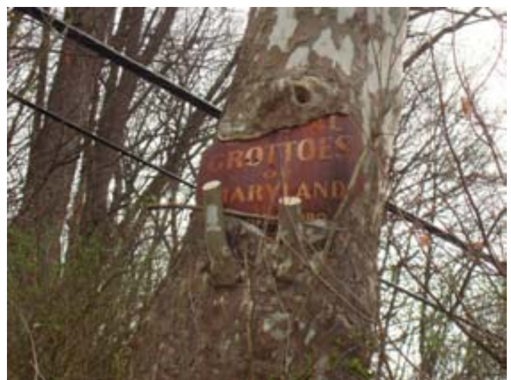
Old Crystal Grottoes sign near Cumberland, MD (Don Cams)