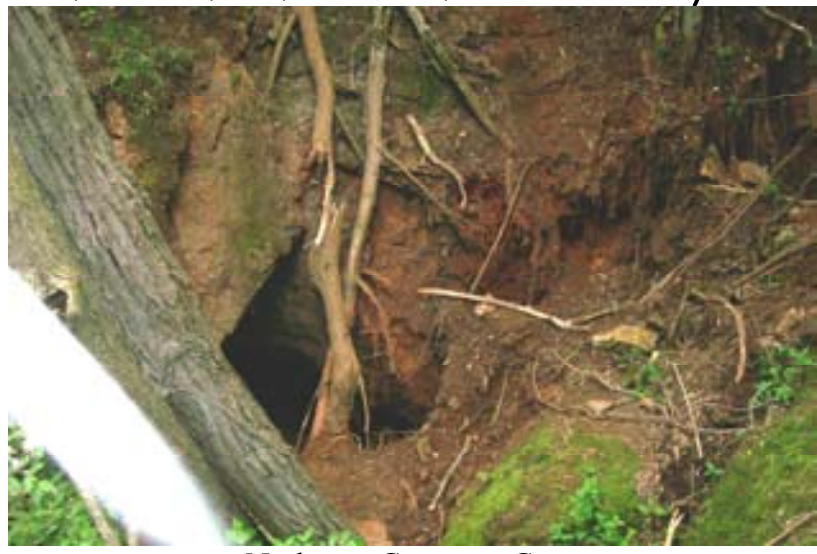
Norbourn Cemetery Cave