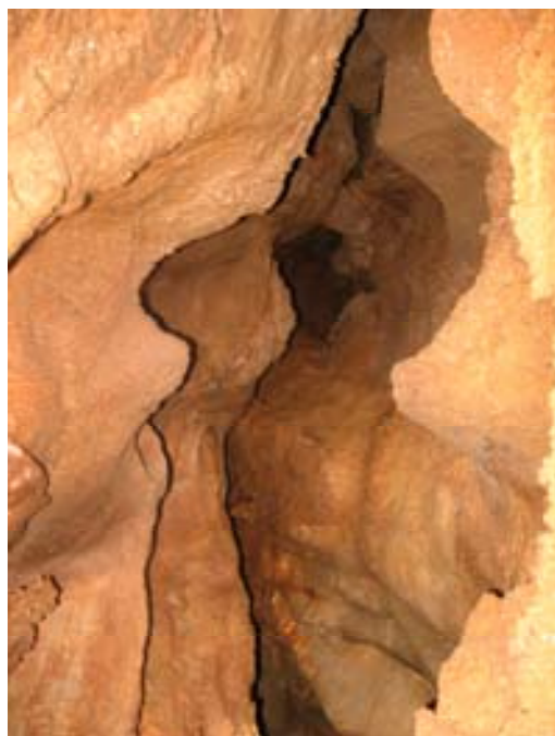
Tight Passage in Coral Cave (Bowen)