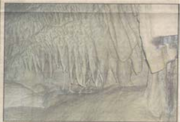
TAKE A LOOK - Rock formations (above) inside the newly discovered cave near Scherr.