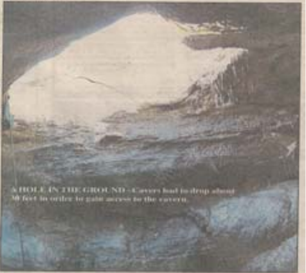
A HOLE IN THE GROUND - Cavers had to drop about 30 feet in order to gain access to the cavern.