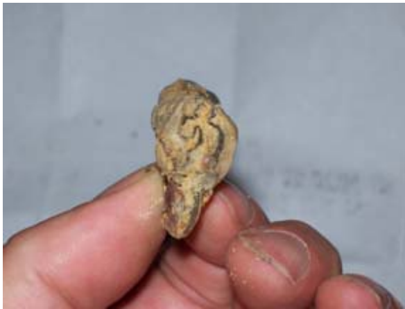
Bottom of Bone or tooth