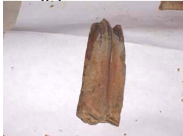
Side view of bone or tooth