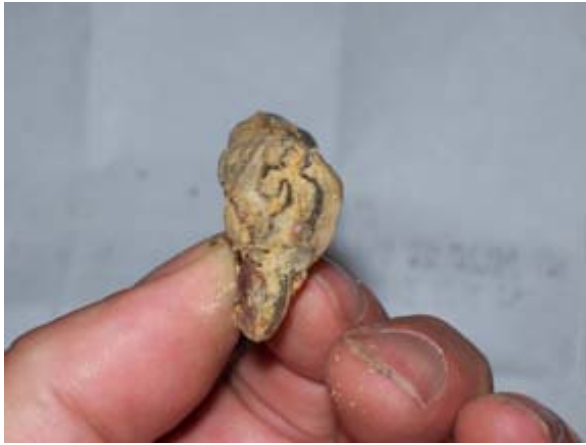
Bottom of Bone or tooth