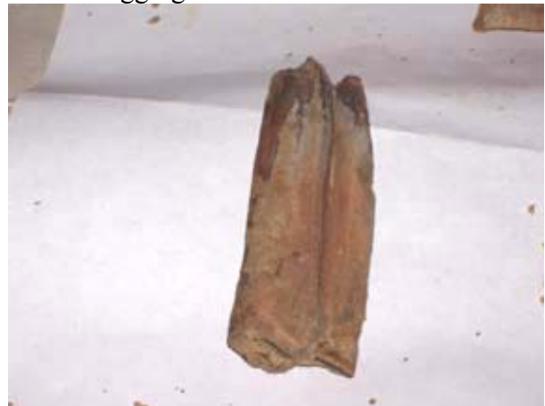
Side view of bone or tooth