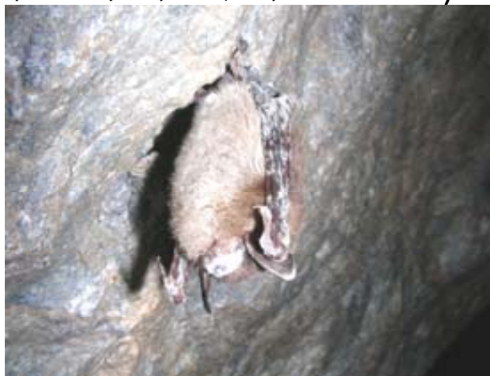
WNS in Greeley Mine, PA