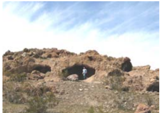
Lava Tube on Navajo Reservation