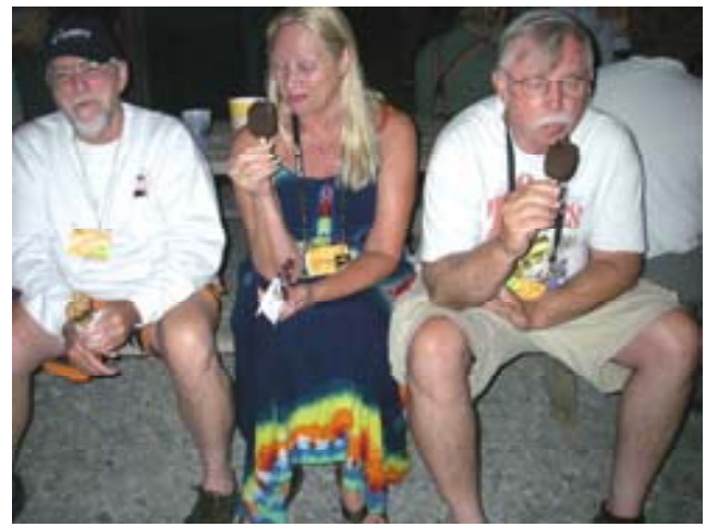
Enjoying ice cream at OTR