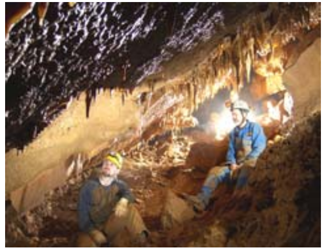
Jones Quarry Cave