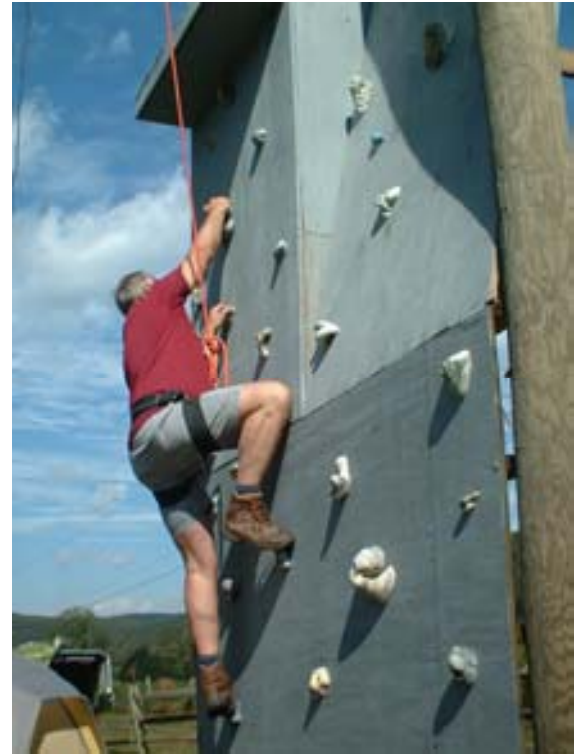
JC at Fall Bash