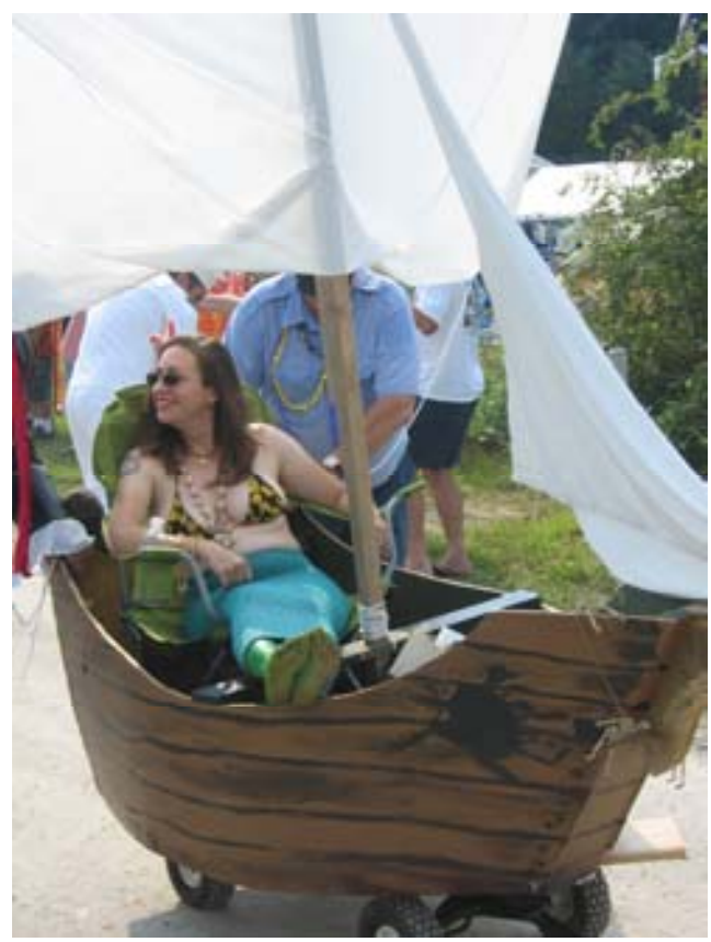
Our very own mermaid in the pirate ship