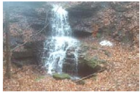
Water Fall at Paxtons Cave