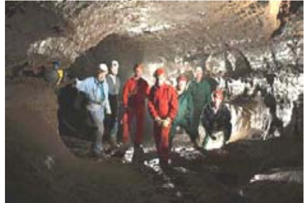
We stopped for a group photo where the water stopped us in Wildcat.

quickly made to abort and look for something else to get into.